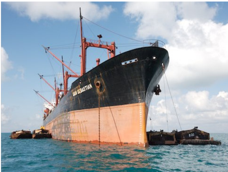
Unrefined cane sugar is loaded onto the 14,000 tonne San Sebastian, four miles out to sea, in Belize. It takes approximately one month to load the ship and a further 21 days to sail to the Thames Refinery in the UK