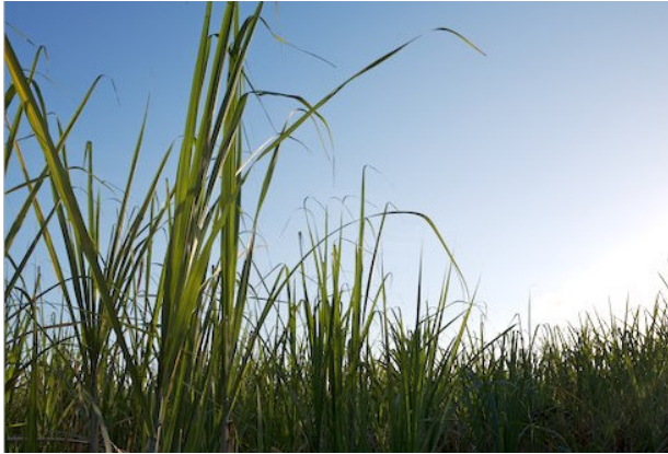
Cane sugar fields Belize Central America