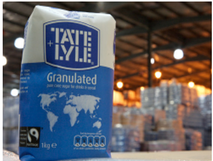
Cane sugar, refined at Tate & Lyle's Thames Refinery, is packed into the new look Fairtrade branded packaging