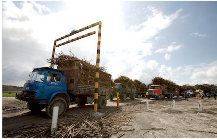
Delivering raw cane sugar by truck to the mill, Belize