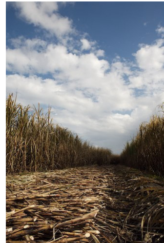
Cane Sugar Field / Harvesting cane sugar in Belize