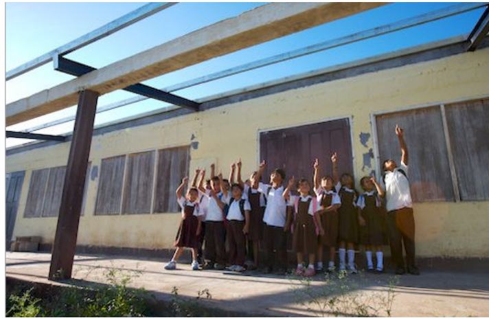
Children at the Xaibe Roman Catholic School, Xaibe Village (Corozal district, Northern Belize), point out damage to their school building caused by Hurricane Dean last year