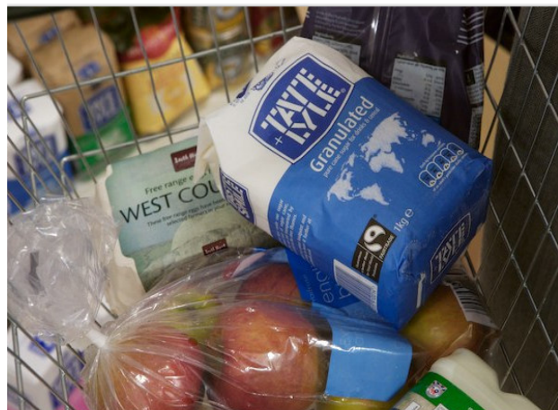
Tate & Lyle Fairtrade cane sugar – In shopping basket