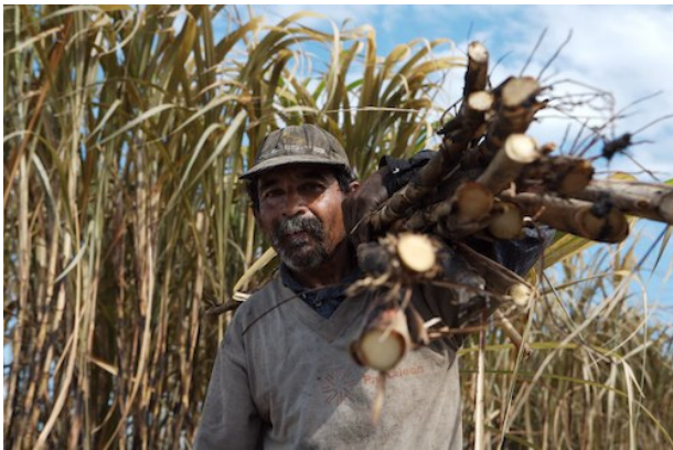
Hand loading freshly harvested cane sugar