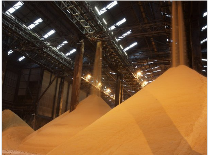
Unrefined cane sugar is unloaded at the Tate & Lyle Thames Refinery, UK