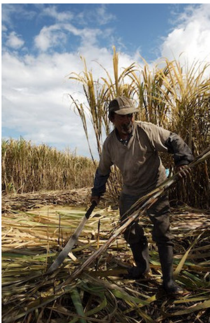
Harvesting cane sugar by hand