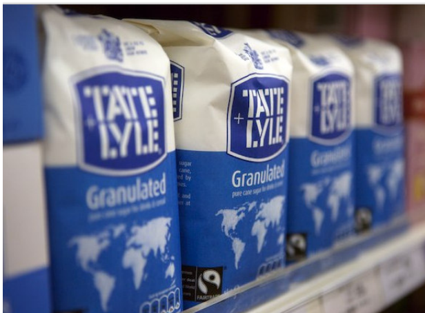
Tate & Lyle Fairtrade cane sugar on shelf