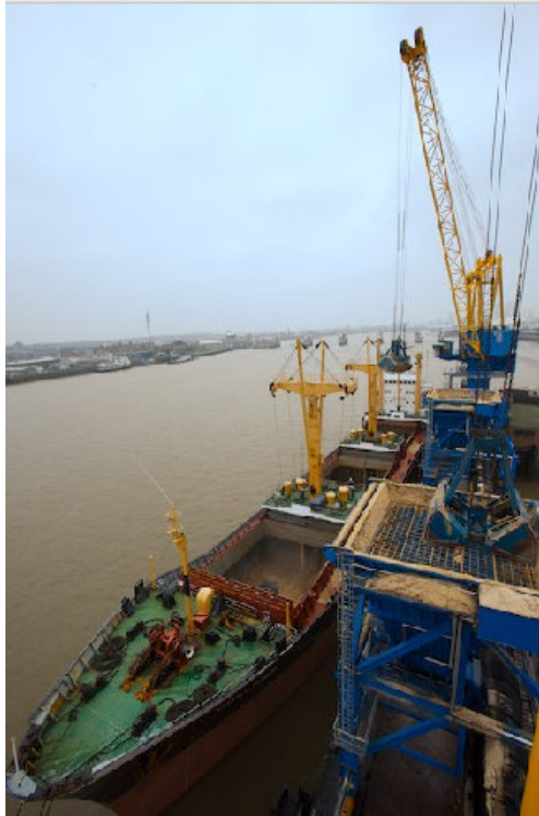
Unrefined cane sugar is unloaded at the Tate & Lyle Thames Refinery, UK