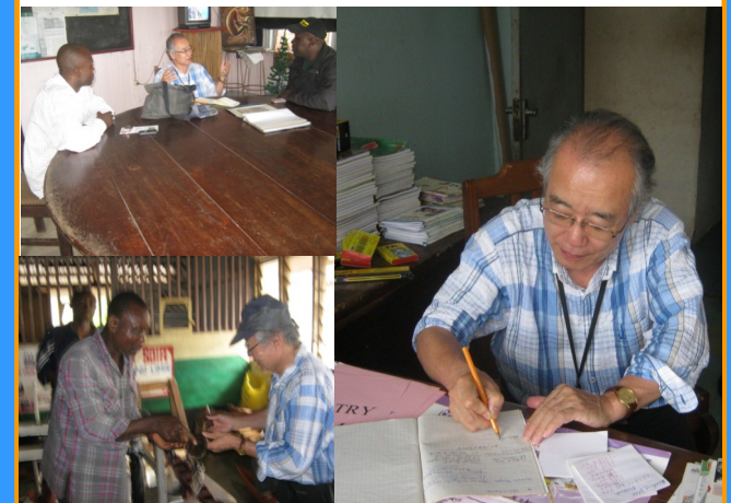
Signing of the guest Book by our collaborators

Is a goal that requires likeminded individuals and organizations to be attained