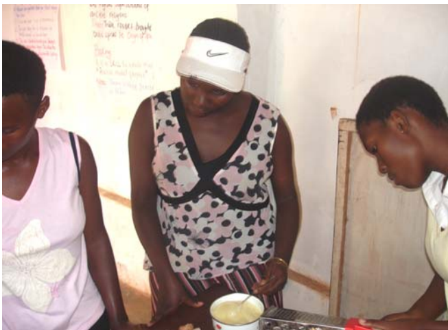
YOUTH IN A HOLIDAY CLASS