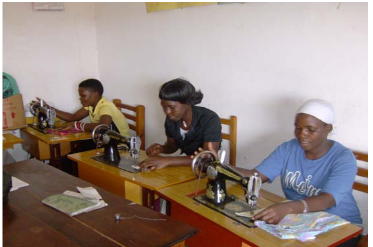
YOUNG LADIES IN THE TAILORING CLASS