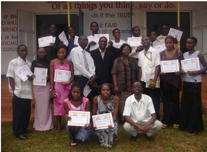
YOUTH AFTER A COUNSELLING CLASS