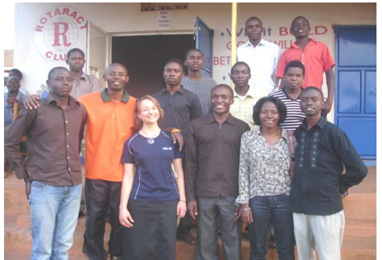
YOUNG MALE LEADERS AFTER A DOMESTIC VIOLENCE WORKSHOP