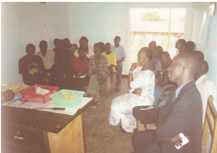
YOUTH IN A COOKERY CLASS