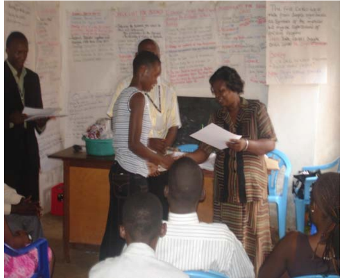
YOUNG LADY GRADUATING FROM SMALL BUSINESS COURSE