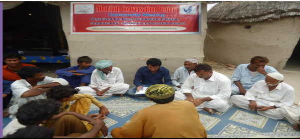
Community discussion on safeabortion

Women who have sought abortions are often ostracized by communities or murdered by family members. Doctors are also reluctant to speak openly about the need for safe abortion or to state that they perform them. There is lack of discussion on abortion. Despite the legal status of early abortion in Pakistan, poverty, illiteracy, unawareness about the abortion law, social and religious traditions prevent many Pakistani women from seeking safe abortion services. We generate discussion and debated to less privileged community, where there was lack of education and basic amenities, people were surrounded with a number of socio-economic issue. Traditions has created fix situation for women generally. Specifically in reproductive days women have not options. There is not discussion on abortion and autonomy rights of women. Our proposed activities created at least discussion amongst different sects of society. It opened the door to think over the abortion to terminate unwanted pregnancies.