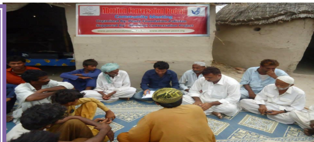
Community discussion on safeabortion