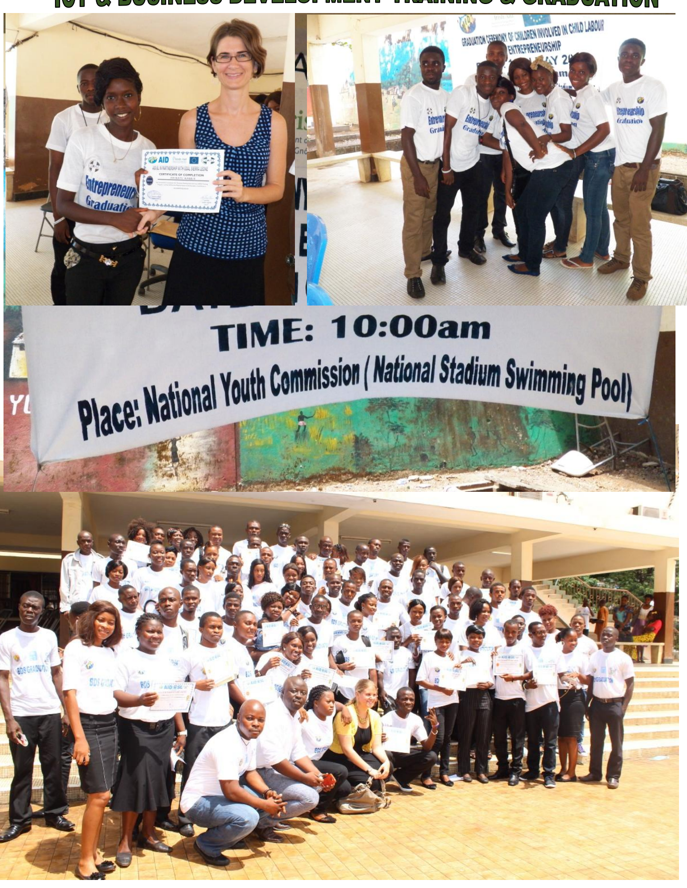
Profile of the Advocacy Initiative for Development (AID) 17 Circular Road, 3<sup>rd</sup> Floor, P. O. Box 1465, Freetown, Sierra Leone