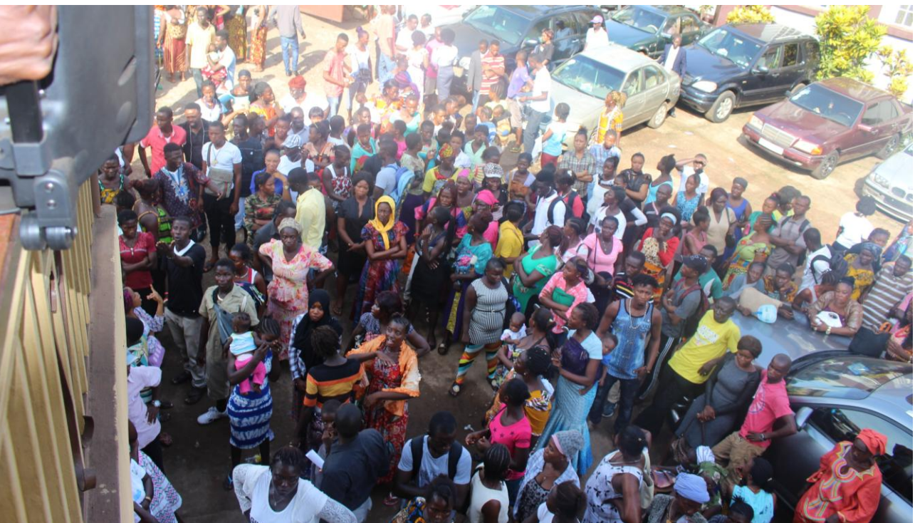
Profile of the Advocacy Initiative for Development (AID) 17 Circular Road, 3<sup>rd</sup> Floor, P. O. Box 1465, Freetown, Sierra Leone