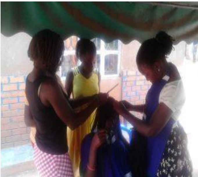
Some of the hair dressing students being guided on how to plait hair.

3.2 Hairdressing —In Uganda, most urban women plait their hair, so targeting those women, our HAIRDRESSING training teaches mothers how to plait and set different hair styles, such as twist, dreadlocks, corn rows, etc. After training UWOPED helps them set up simple salons, and we also try to offer start up kits to help them get their businesses going.