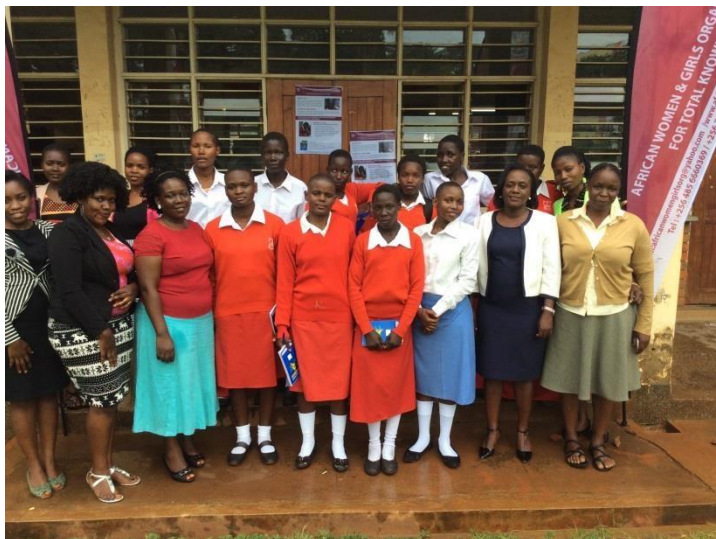
The National Director and Some of the teachers poses with the students for a photo during a school visit.