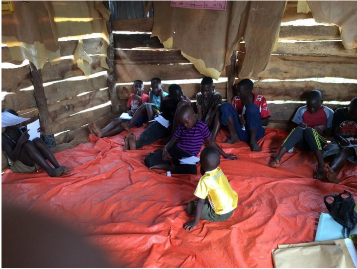
Some of the children during the holiday classes and checkups.