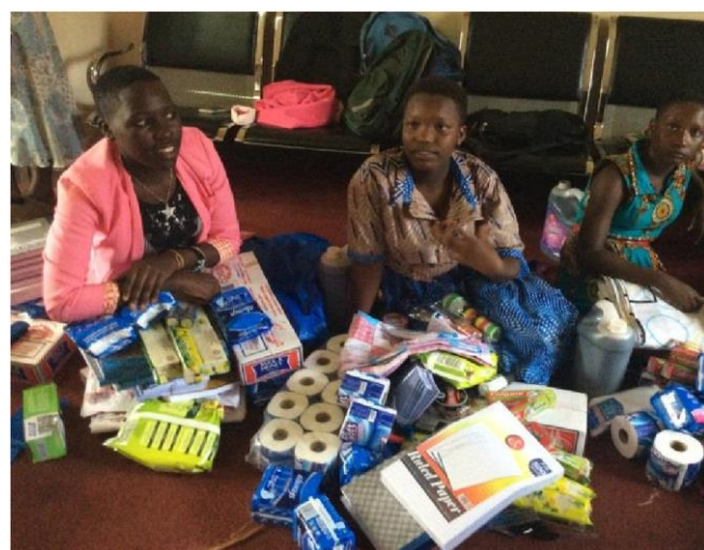
Students picking their school requirements as they are going back to school.