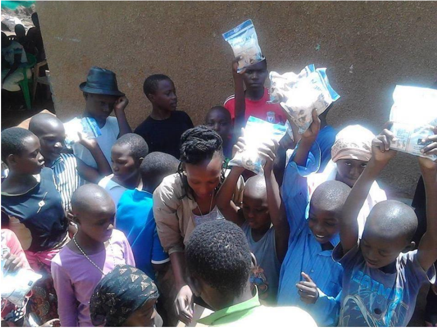
Children receiving holiday package (Rice)