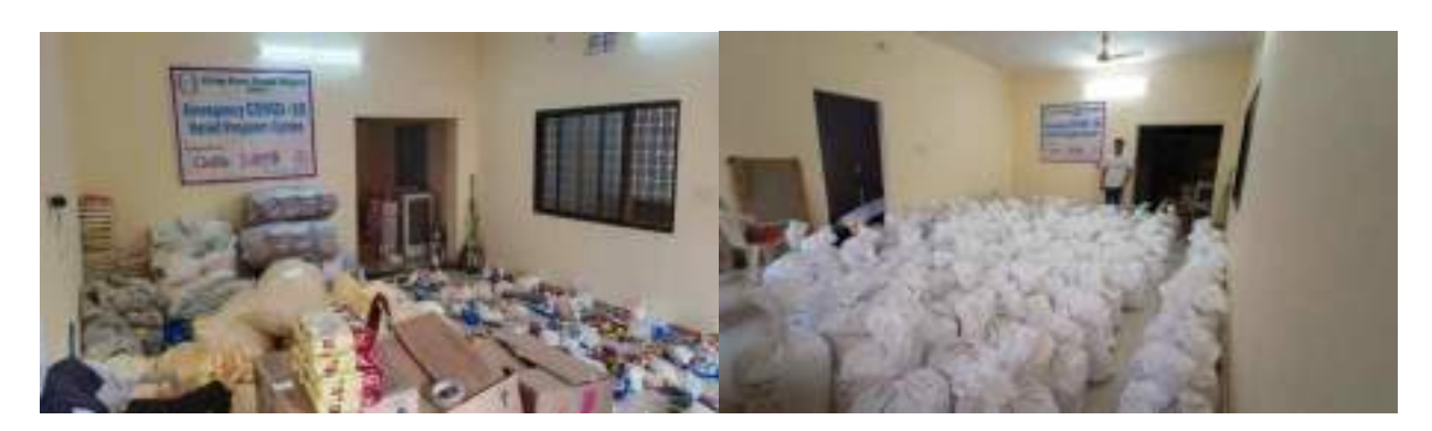
COVID 19 Relief Program for Shivaji Nagar Slum/Village Monitoring Survey Report Monitoring at Shivaji Nagar Slum/Village

People are facing uncertain and difficult times in the face of the Covid-19 pandemic. To support the affected families, we have converted our office into temporary Covid Relief Program Centre where we have done all the planning, meetings related to the program. All the grocery items and preventive kits were delivered at our center and then the team members of GSS/JAFS arranged the grocery items into grocery kits.