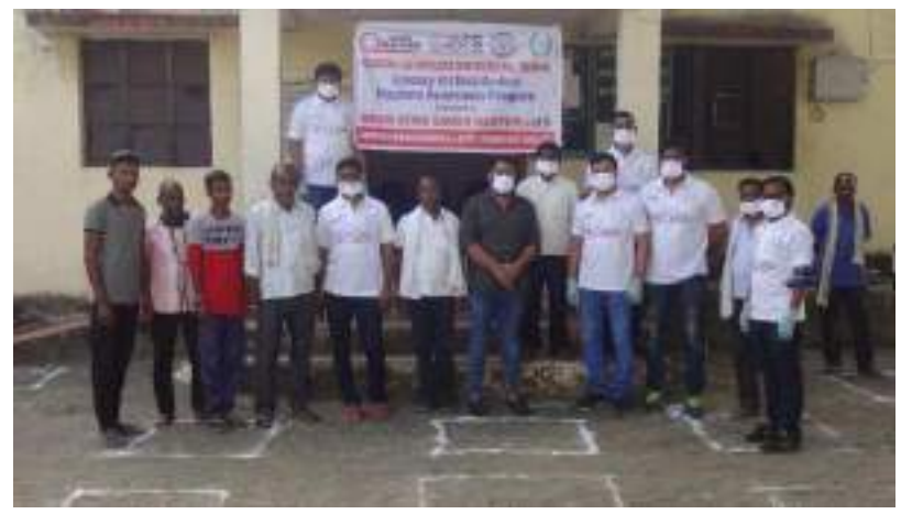
GSS Staff and Volunteer along with Resource Person