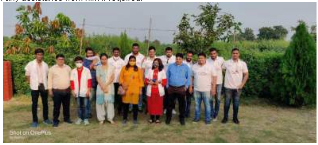
GSS Staff, Volunteers, Resource Person and Medical Team

Some local spectacle shops came up with their stalls for providing spectacles to the patients who required at a very nominal cost. The Sarpanch (Head) of the area visited the camp and assured them with any assistance from him if required.