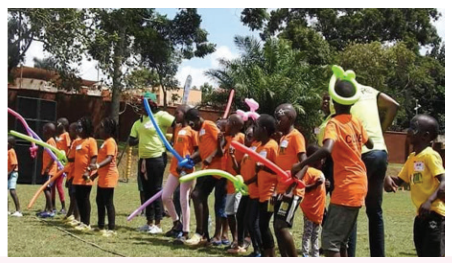
HEALTH HOME INITIATIVE CONDUCTS COMMUNITY AWARENESS AND SCREENING IN KAYUNGA, MUTUNDWE AND BUWAMA, JULY, 2018

CS participates in organising the child cancer survivors' camp at Lubowa. In partnership were Baylor Uganda, Texas Children Hospital and Uganda Cancer Institute. The event brought together childhood cancer survivors to participate in a wide range of activities including bouncy castle, football, balloon toasting and blowing.