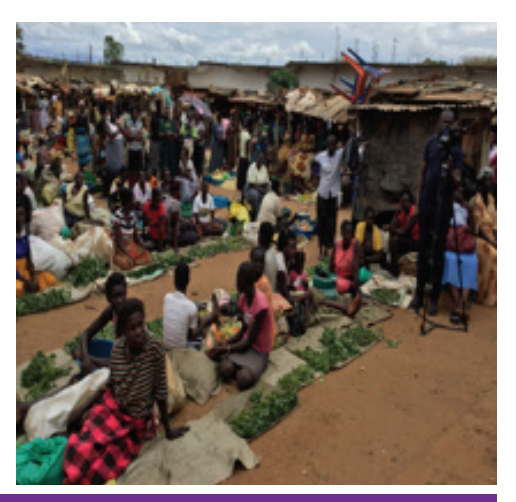
Above: DOF conducts cervical cancer sensitization meeting and screening in Kitgum market.