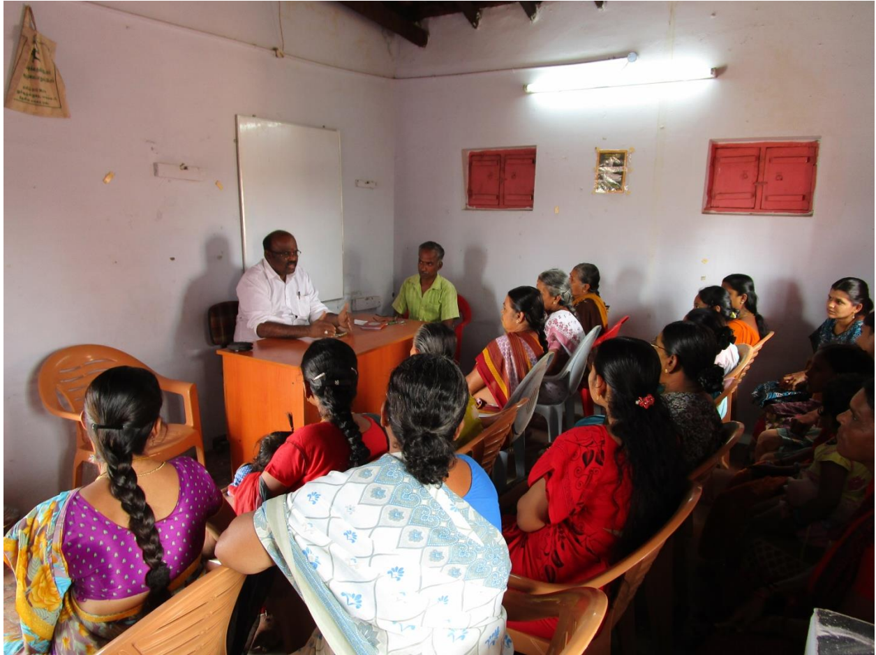
Women Self Help Group leadership Training