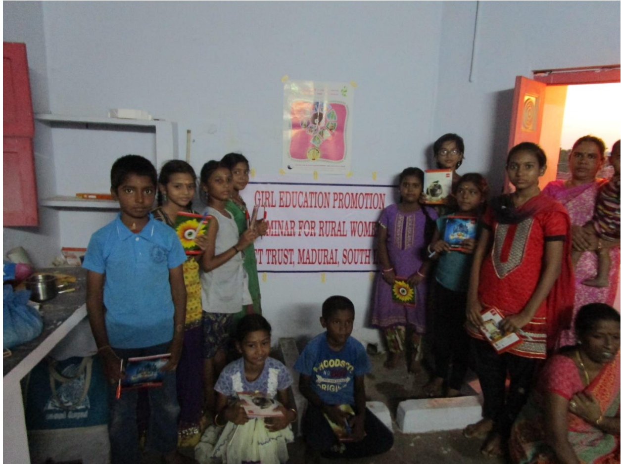
Girl Education Promotion Seminar for Rural Women