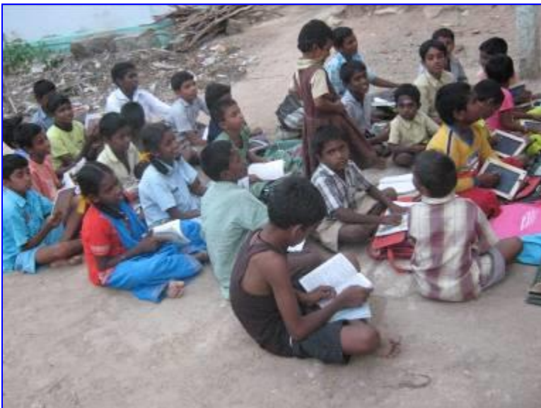
Children are active in learning while they attend the Evening Tuition program at Valayankulam village,