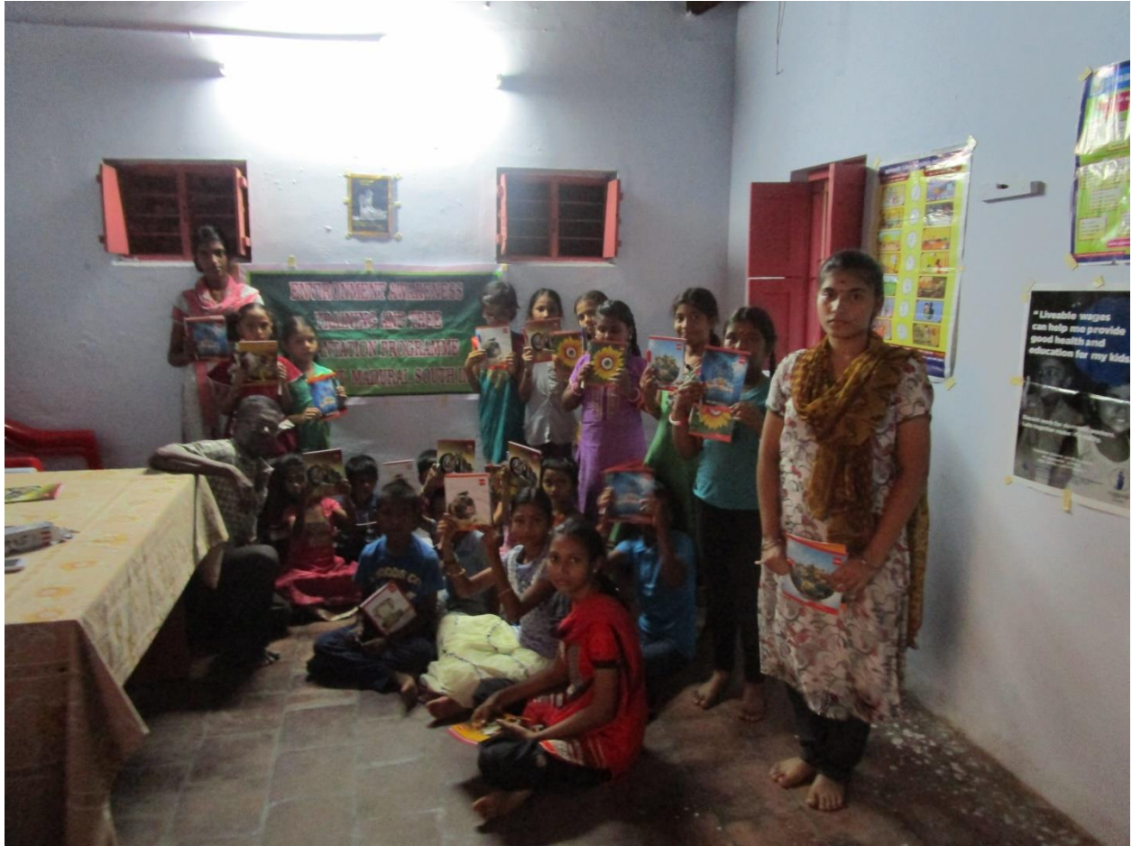
Seed ball concept towards Greening Earth at school and Community Awareness Training among School Children