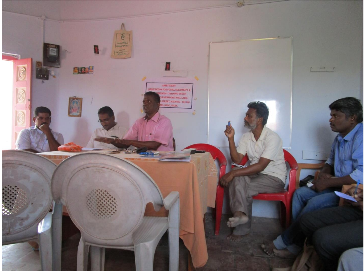
NGO Network and fund raising Training