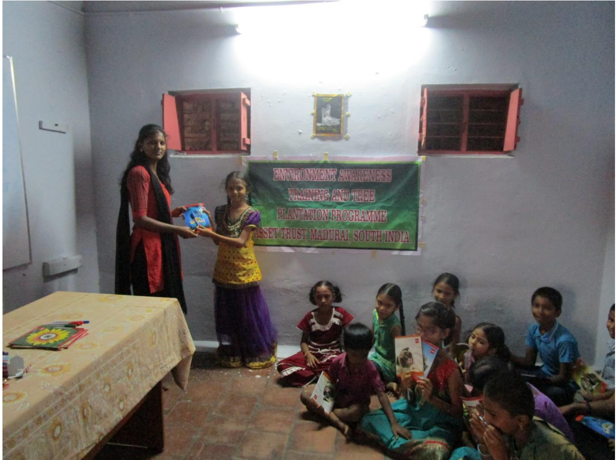
Note Books, Pencil, Pen distribute to Poor Girl children (those who are daughters of Daily wage Handloom Textile Women Workers )