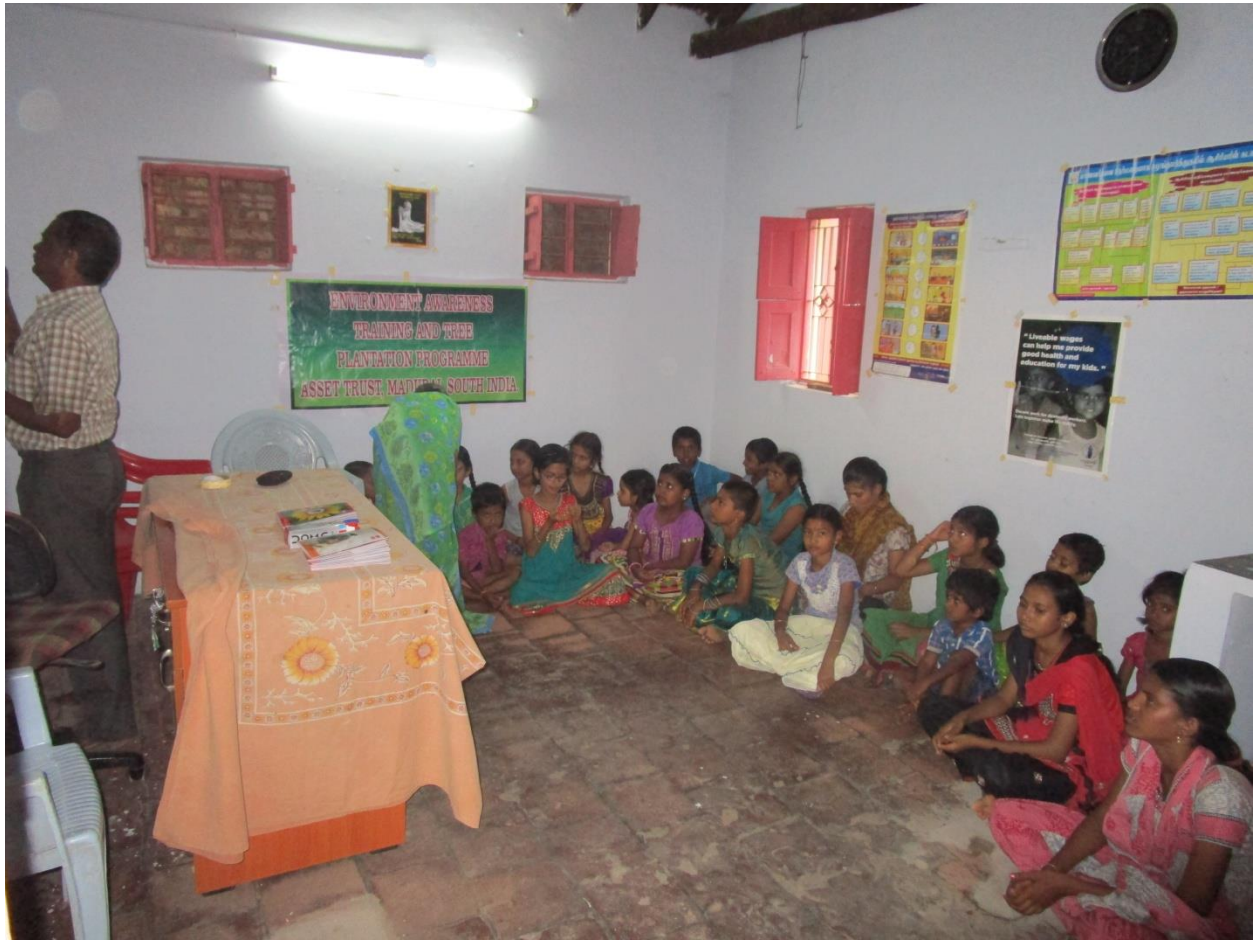
Evening Tuition Centre for School Student