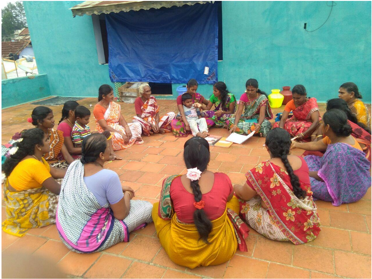
Women SHG Meeting