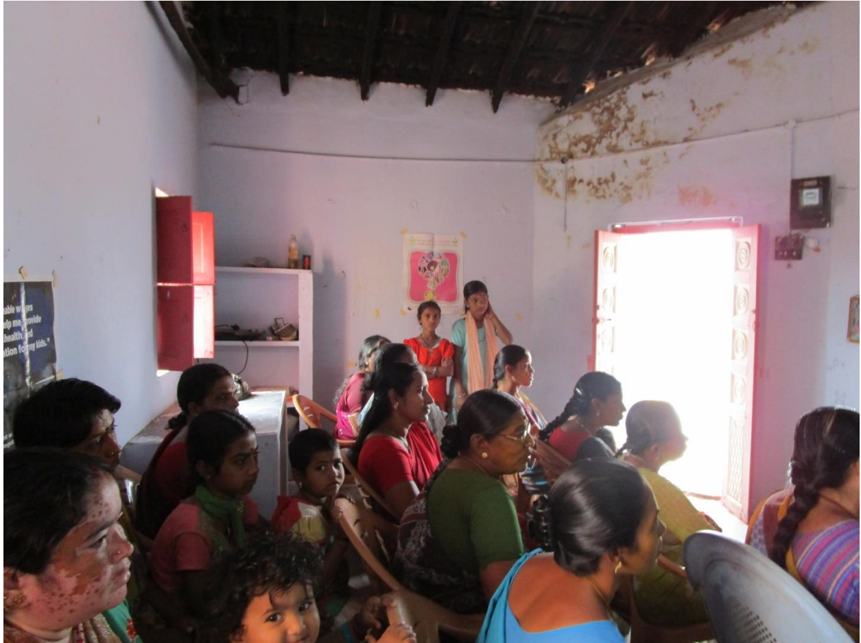
Daily wage Handloom Textile Workers Rights Awareness Training