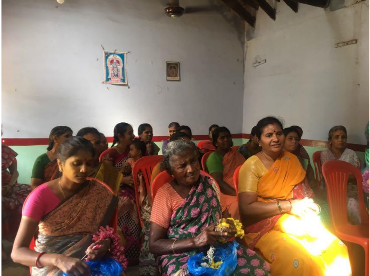
Unorganized Road side Flower Vendors Special SHG Meeting