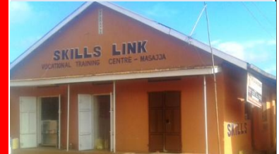
SKILLSLINK Training Centre