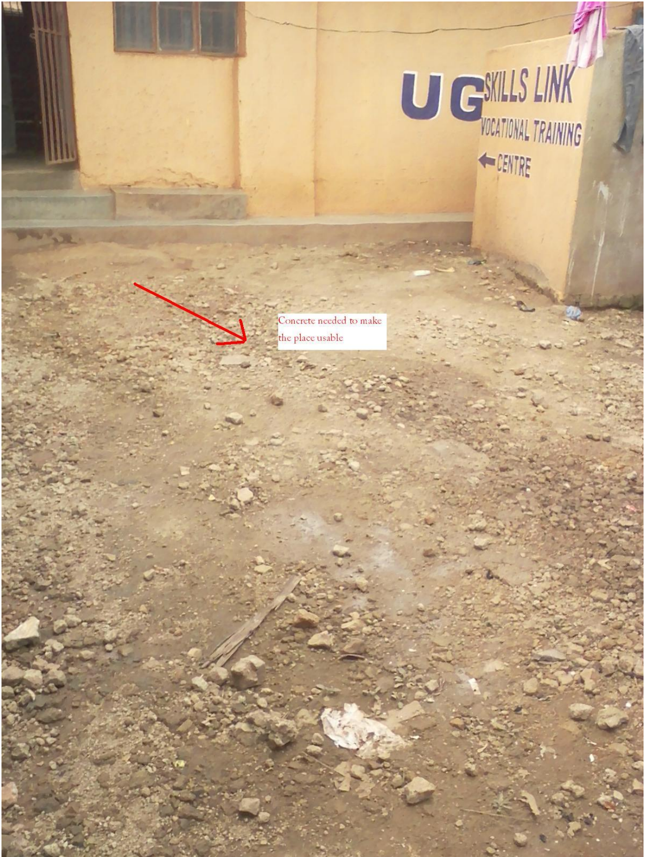
The Red arrow shows the outside space where to put concrete and make the place better for use.