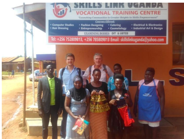
A section of trainees with the Representatives