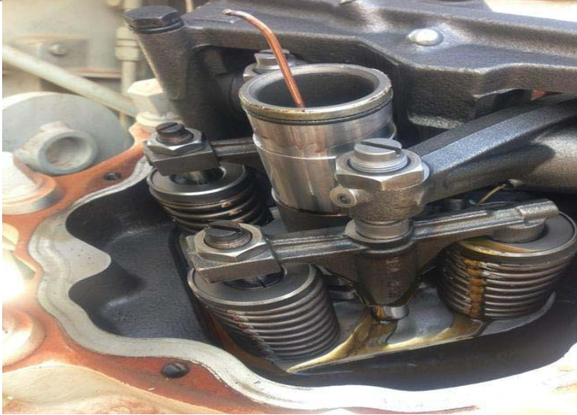
cylinder head checked