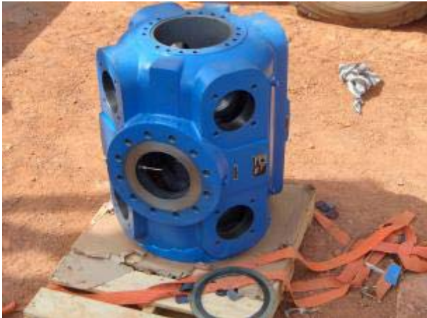
New cylinder to install