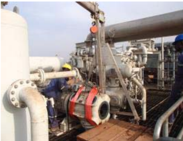
Throw 3 cylinder removal