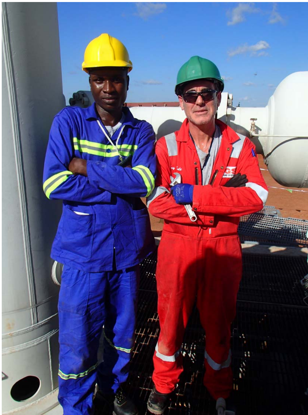
Supervisor and the E&I after a job picture