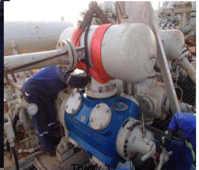
Throw 3 rebuild