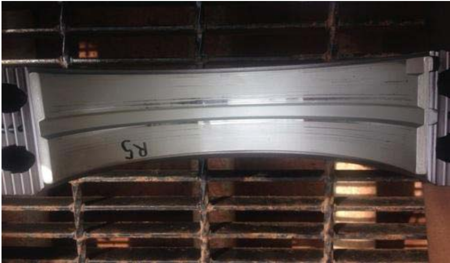
Connecting rod bearing 5R