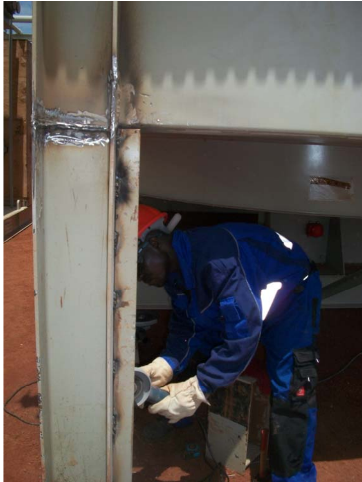
AXH cooler beam re- placement