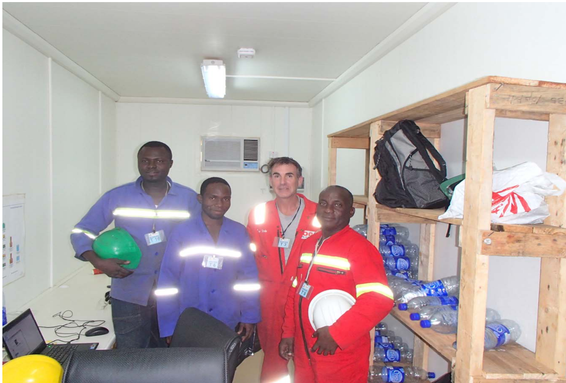
At our site office