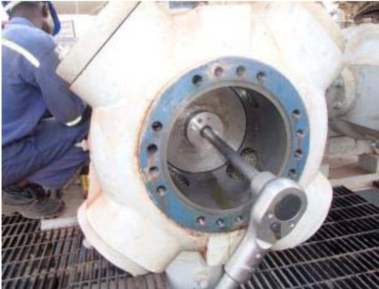
Piston Valve & packing