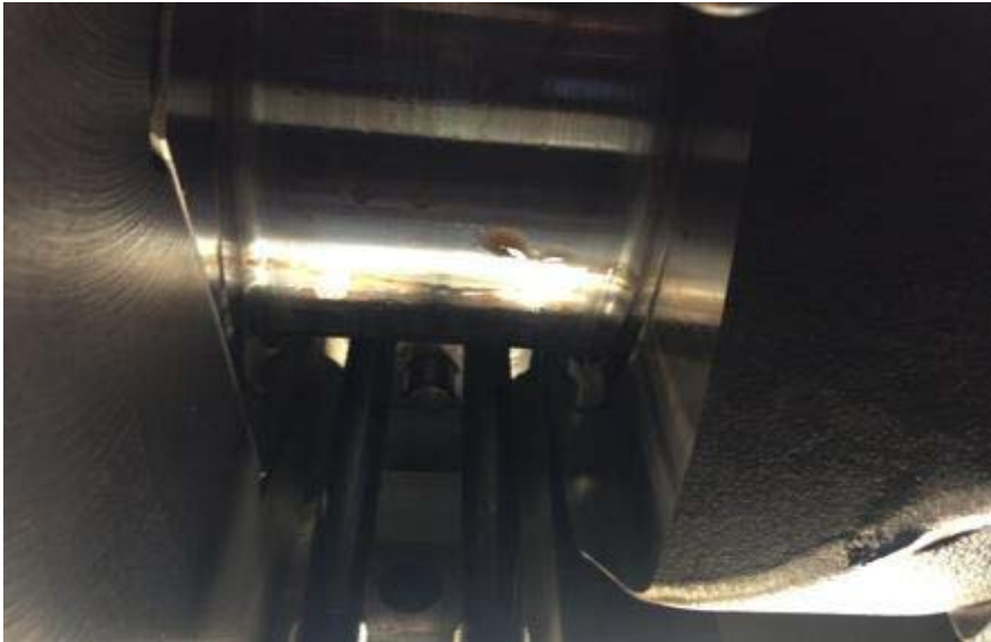
Main bearing number 2 Crank shaft journal