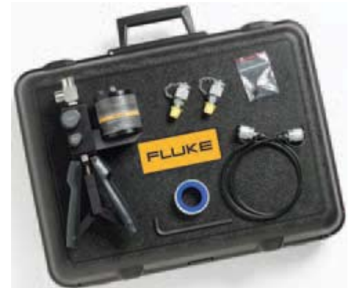
Fluke-700HTPK Hydraulic Test Kit