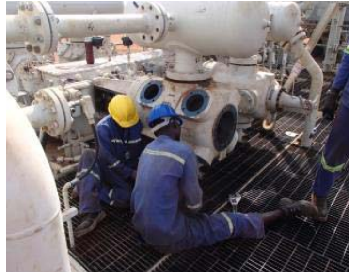
Suction bottle removal