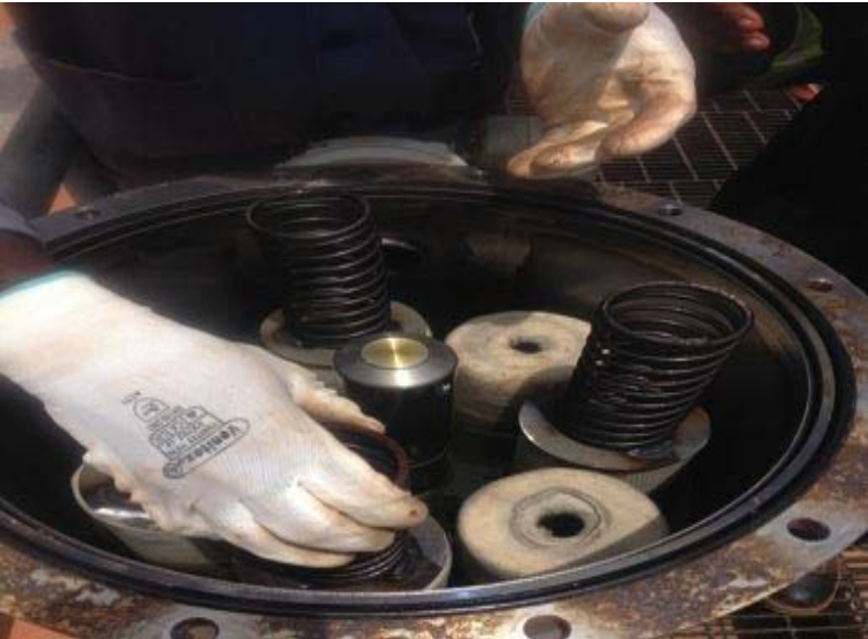
Removed all right bank HT leads and coils, including spark plug extension,