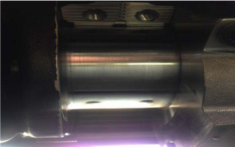
Connecting rod journal 5