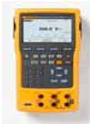
754 Calibrateur de process à fonction de documentation -HART