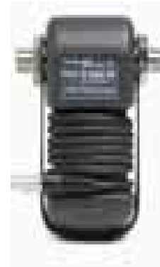
700P Modules de pression différentielle