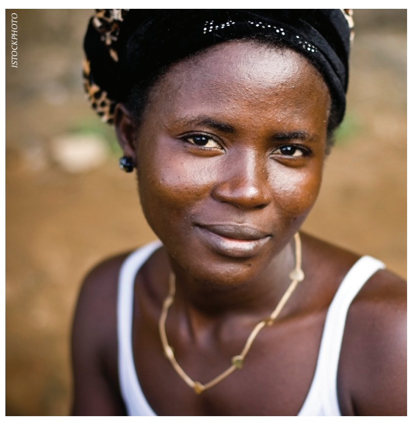
In addition to the knowledge and benefits of exclusive breastfeeding, the women's expressed high intentions to breastfeed were also related to the normative breastfeeding practices in the community.

'I tell them that it is important to leave your child for after 6 months before introducing other foodstuffs because