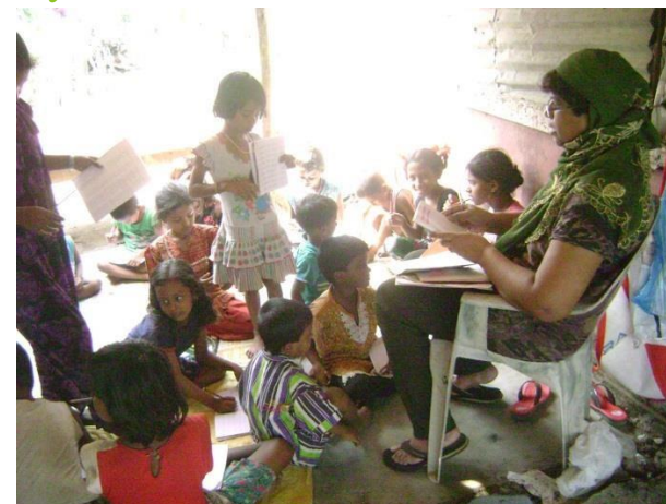
Shifting to Different Slums was Expedient