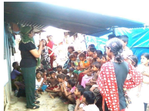
The Beginning of the Slum Ministry Since 2006