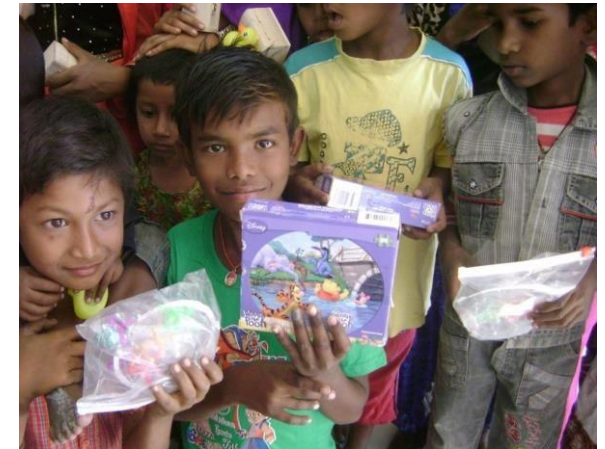
Food and Toys were Distributed