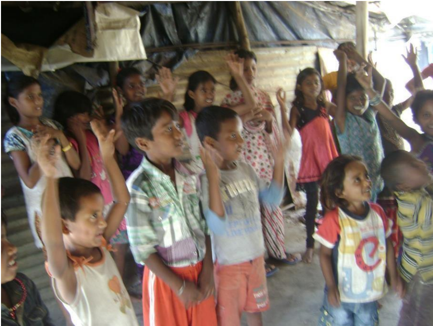
Children learnt to praise God