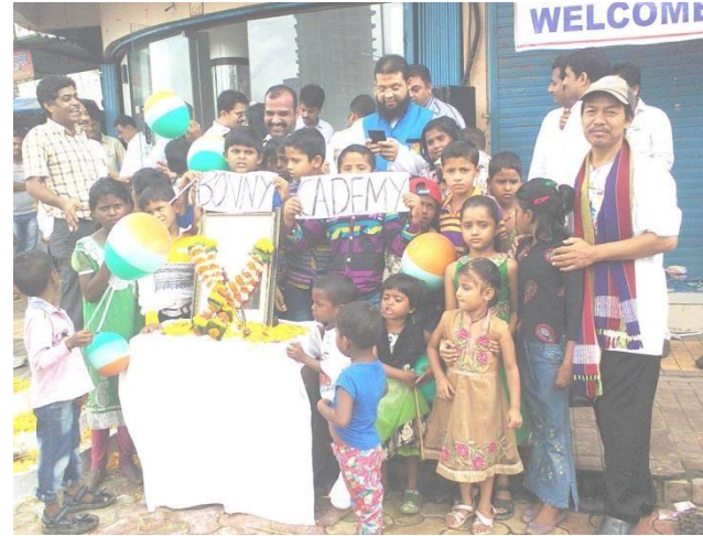
Activity and Free Education Kept the Kids off the Streets