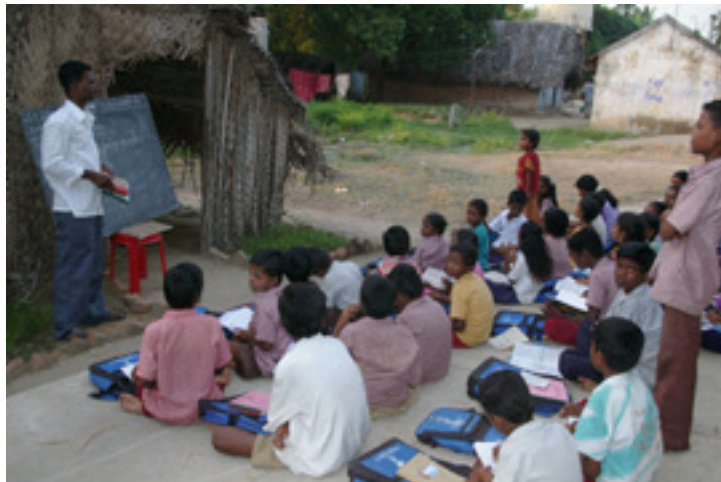
Education centre at Jambothi

As a result of functioning of the centres children are more regular in attending school than before and also their performance in the school exams has improved. Out of the total school going children 11 children come to first 3 Ranks in their respective classes.