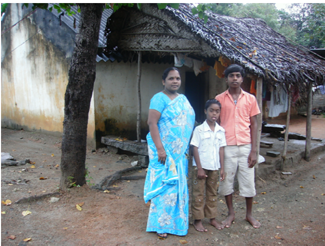
With her children

I started treating small wounds, pains, snakes and insects bites and giving first aid within the villages and in turn the villagers paid me fee. From the knowledge and experiences gained from my practical training at the clinic I also started functioning as birth attended in the villages.