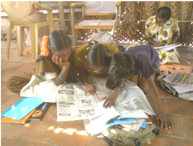
Analysis of news, practical general knowledge

The following are the impacts of the activities carried out: