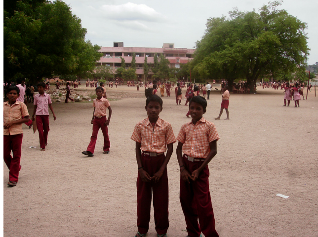
At the St. Michel's school