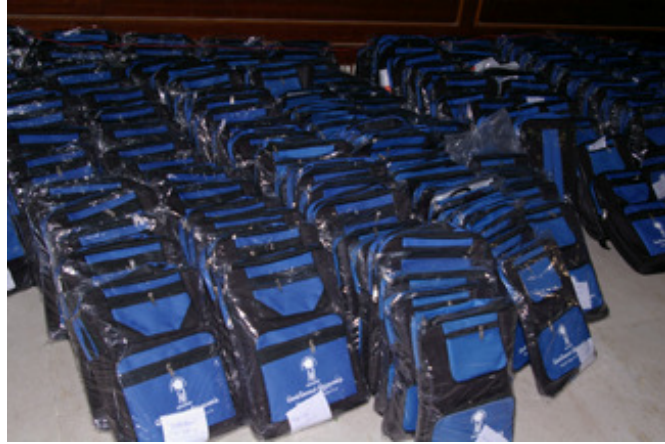
Educational supplies ready for distribution