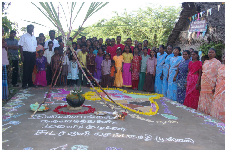
Magalir pongal at Kalarpalyam

b. Magalir Pongal. Usually Pongal festival (Harvest festival) is celebrated for four days and this year to respect the women's contribution in the agricultural fields we have celebrated a fifth day of pongal calling "women Pongal" along with the Self help group members.