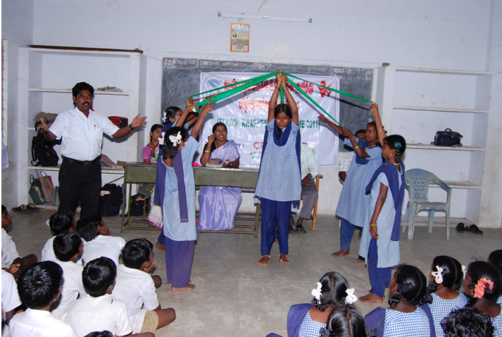
The school children perform in school awareness programme