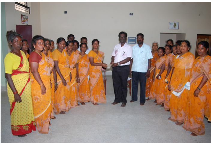
A women group receiving direct loan