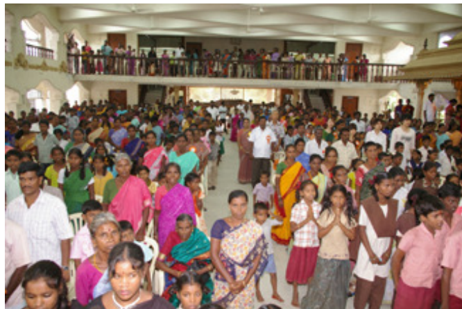
View of the children and parents gathered to receive the educational supplies