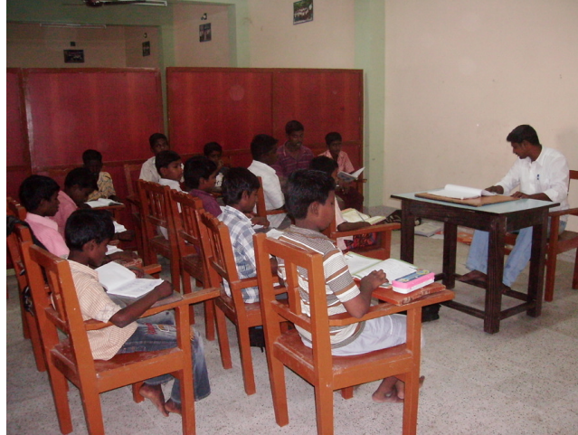
A view of the children during study hours