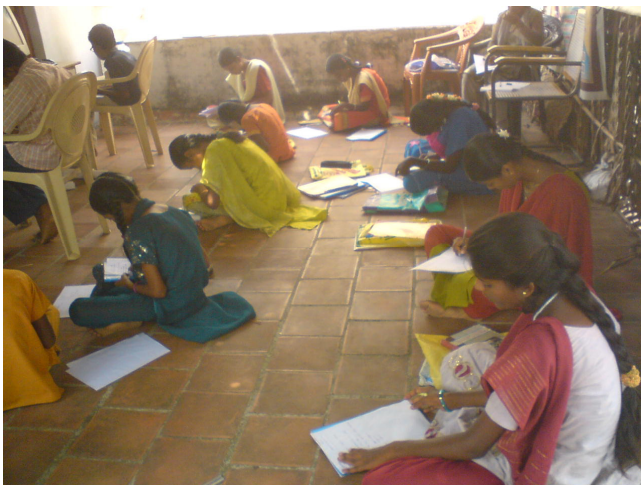
Informal education centre at Palapadi village