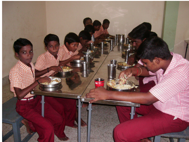
Children at Dinning at the newly build CECOWOR children home

They were also given support to buy books, note books, school uniform, and stationeries and to meet out the school fees expenses. The male children were accommodated in the home run by CECOWOR and female children in other homes specifically running for the girl children. The children who are living in the newly constructed building and all the children and the CECOWOR team is very happy and thankful to ACA Denmark for supporting the purchase of land and construction