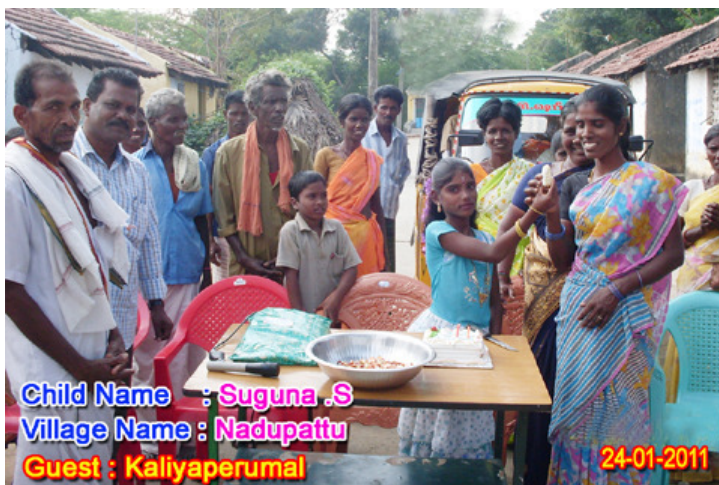
Birth day event

Speeches were given speeches, posters were displayed, and bit notices distributed. Villagers were gathered at one place in their villages to celebrate the day as public event. Loudspeakers were also hired. The respective PLF and SHG were actively involved in the organising the event. For many girls it will be first time they celebrate the birthday because they are seen as unwanted liability to the family. According to our plan we have celebrated birth days in 30 villages for the girl children born on the born on the 24 th January. In a few villages there were two children born on that day where we celebrated the day combined