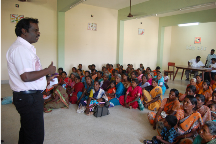
Women leaders meeting

These SHGs also have functioned as pressure groups to initiate changes, take up issues of common concern and defend the rights of the members in the village level.