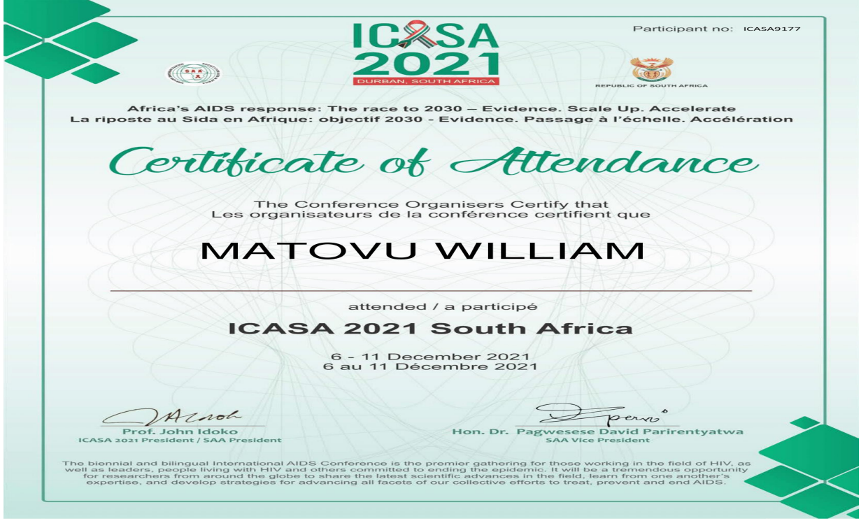
Figure 4 shows a certificate of attendance that was awarded to william by ICASA Team

The race to 2030 - Evidence. Scale Up. Accelerate