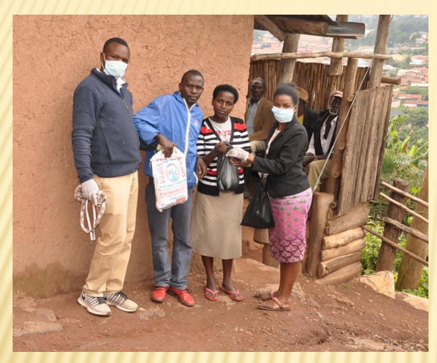
Some of the Vulnerable households Supported with food items