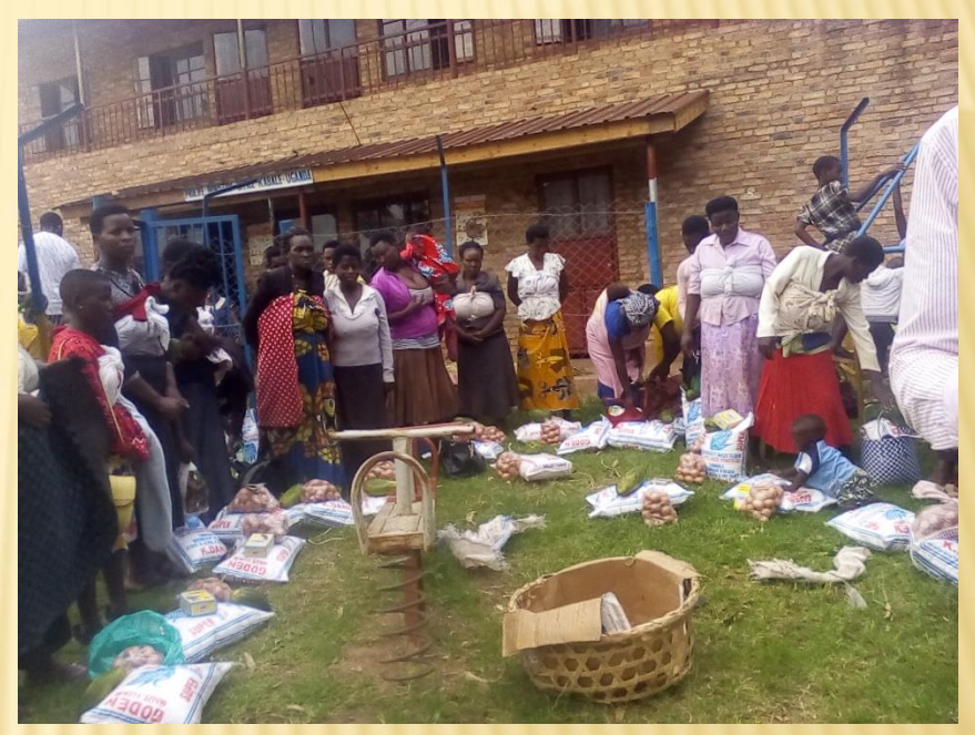
Breast Feeding mothers given food support