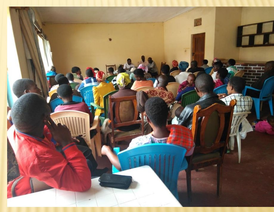
Organisation Members at the AGM