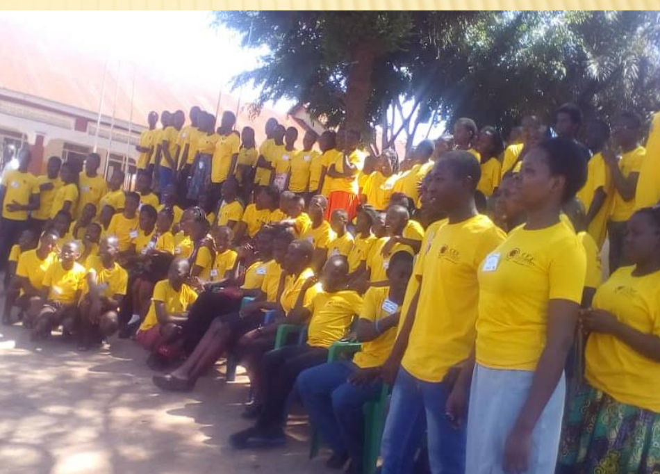
Youth trained in Child Evangelism