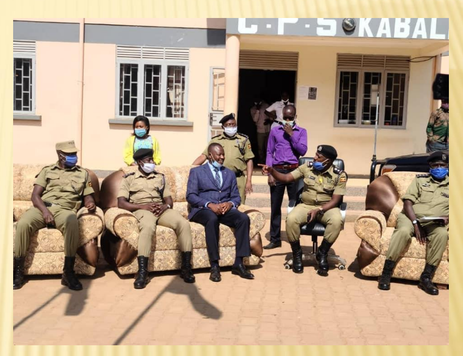
One of the Police Stations Supported with Office Chairs