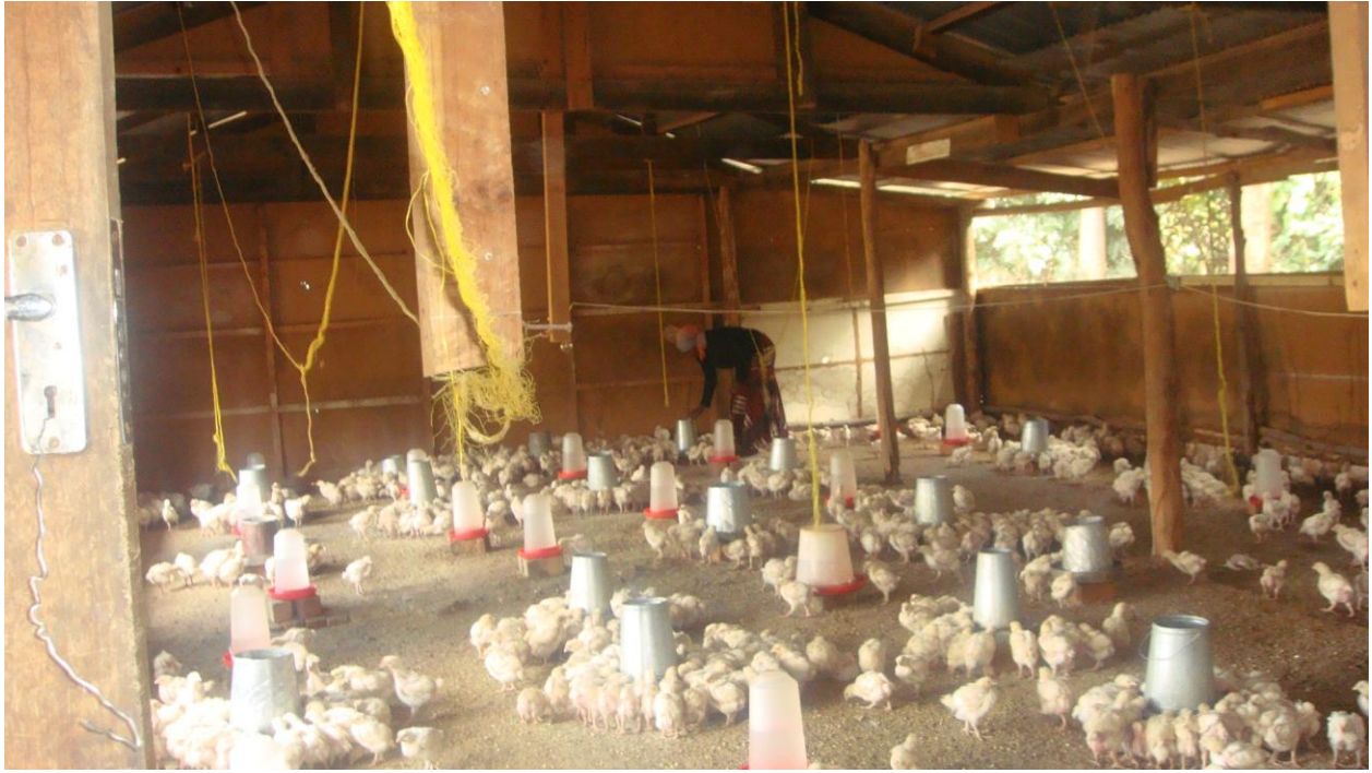
The current 1700 bird to be ready for sales by 20 th may 2013