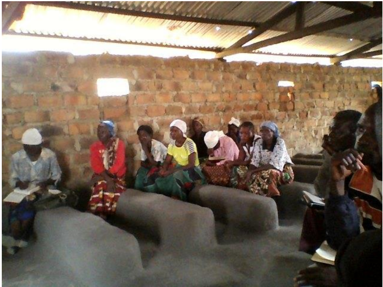
Samaritan women during vegetable garden class program

place in order to lessen the heavy burden on these families so rounding our local churches in the outskirts of Lusaka called kasisi.