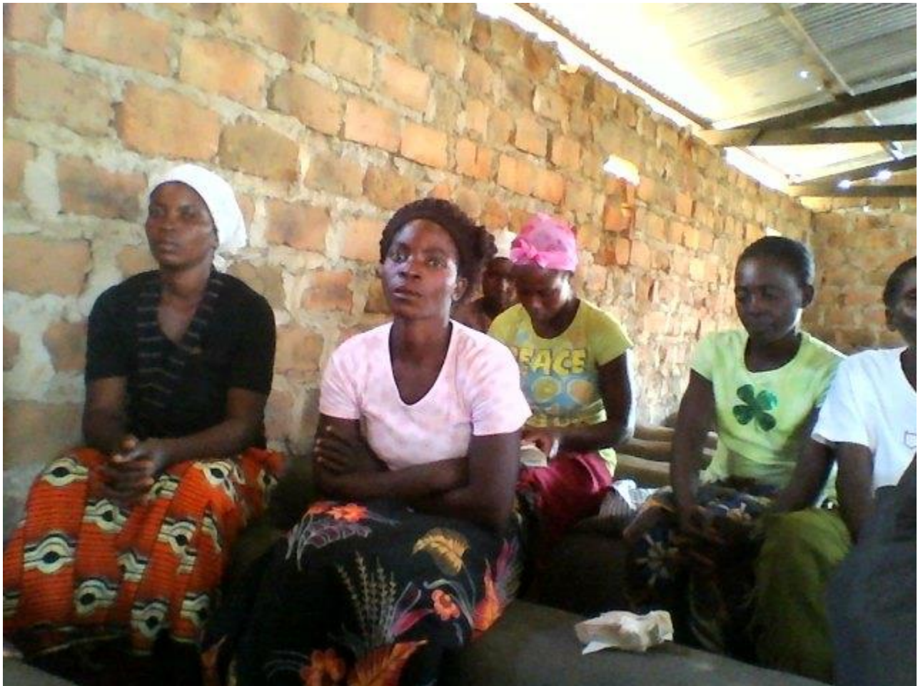
Samaritan women during poultry training

This chicken project is expected to empower close to 30 women with knowledge and tools for small scale chicken production by the end of this year.