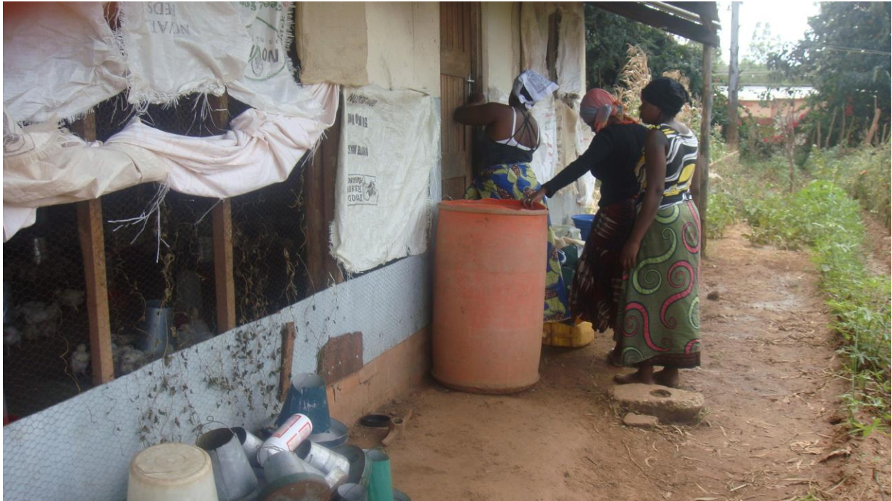
Samaritan Women preparing to water the poultry drinkers manually