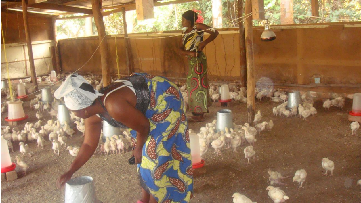
Women checking & evaluating mortality each day