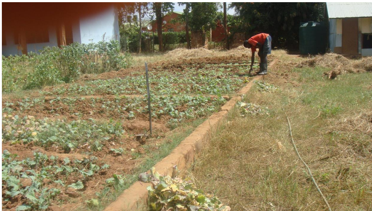
The far end of the women vegetable project and store rooms

The first vegetable project undertaken is the tomatoes Garden which was done in november 2012 to run up to August 2013 . The tomatoes Garden was selected to be done by the women's because it requires very basic agriculture knowledge which can easily be implemented by the widows offering part time labor. Its inputs are affordable and the markets are available at all times since most Zambians use the tomatoes in the food preparation. 100 X 55 METERS of field has been done for this project and the garden is watered by summer rains as we have no borehole or irrigation equipment.