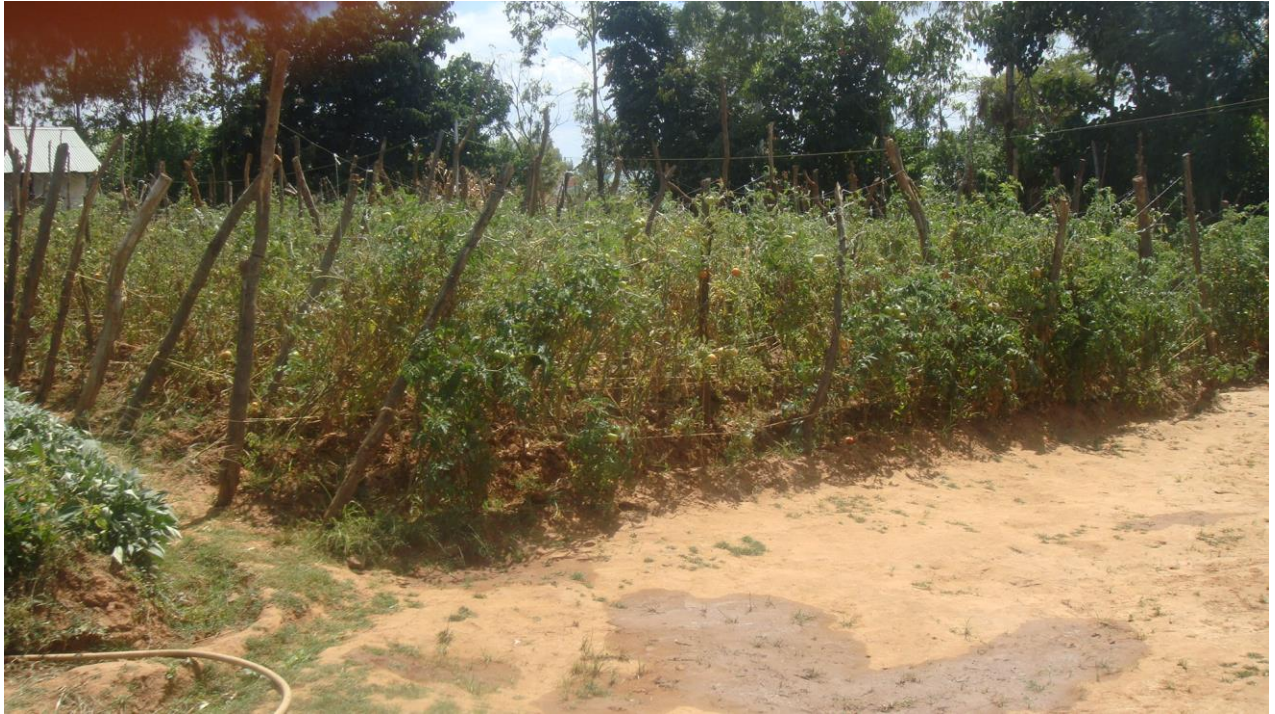
The tomatoes Garden. The tomatoes are now ready for harvest from April 2013