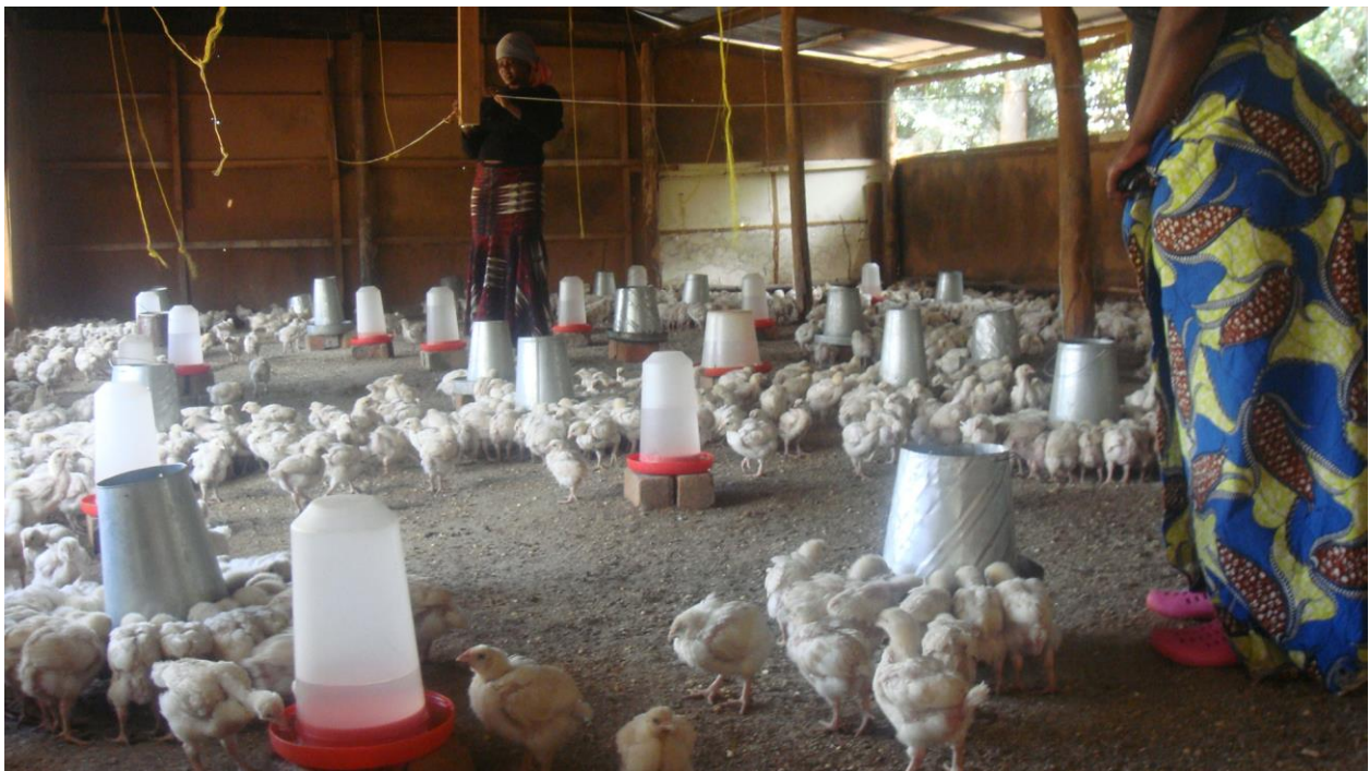
Inside the poultry house. The room has capacity to hold three thousand birds if cared properly