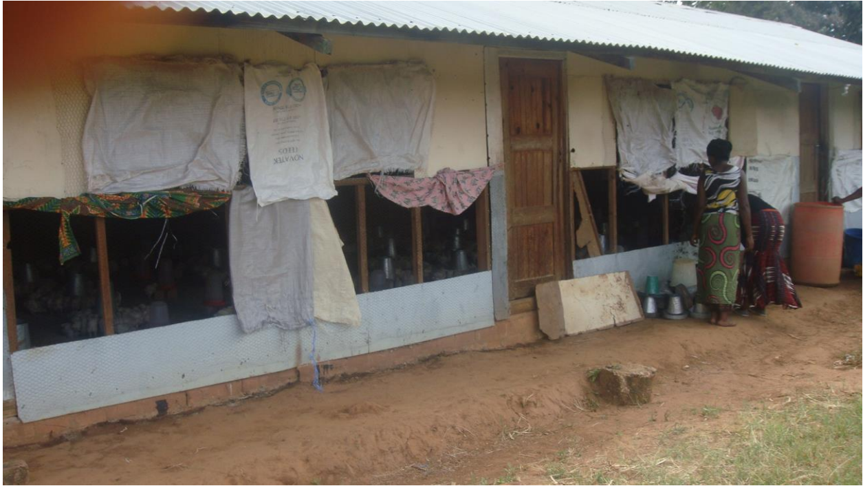
Front side of the poultry house with women students cleaning up the premises