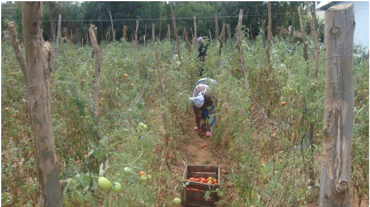
The Samaritan womens club members harvesting the tomatoes. About three to five boxes are collected and sold per week. The harvest period is three months.