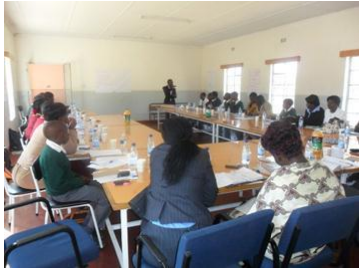
Launching Youth alive club with Zvishbane Schools