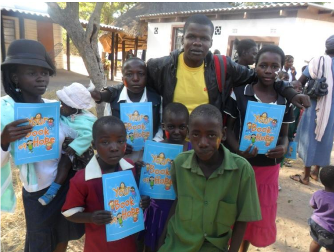
Lower Gwelo Support Group