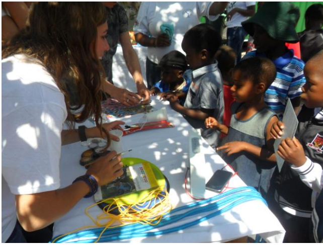
Mtapa clinic fun day with children