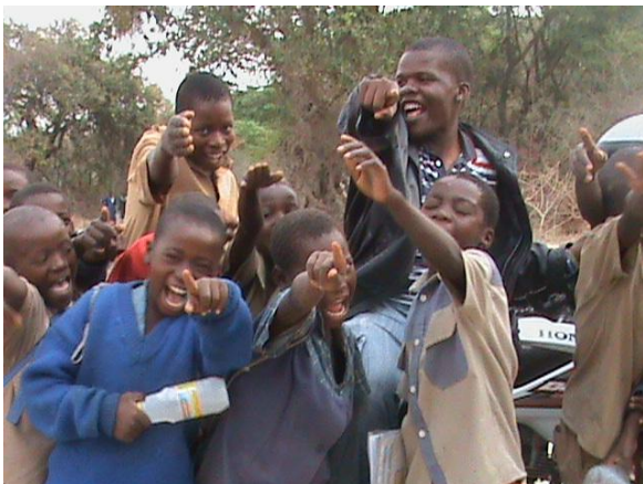
Hankie mission primary school kids