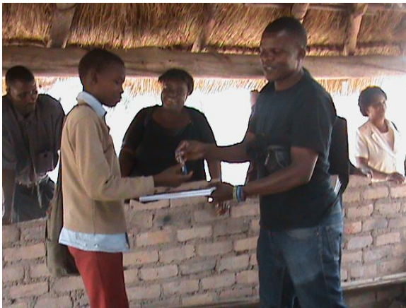
Donating stationery to resettlement school near Hwahwa prison