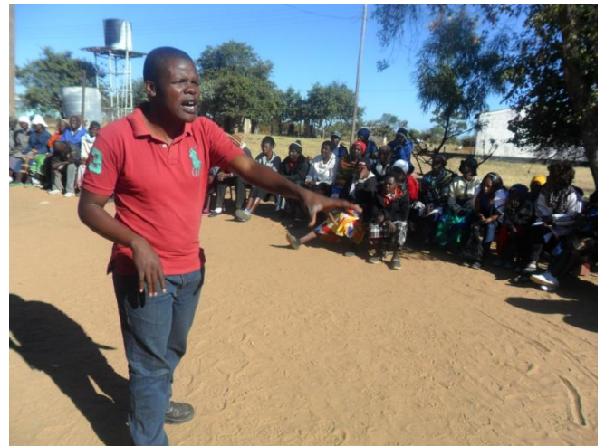
Addressing Caregivers at makepesi Clinic