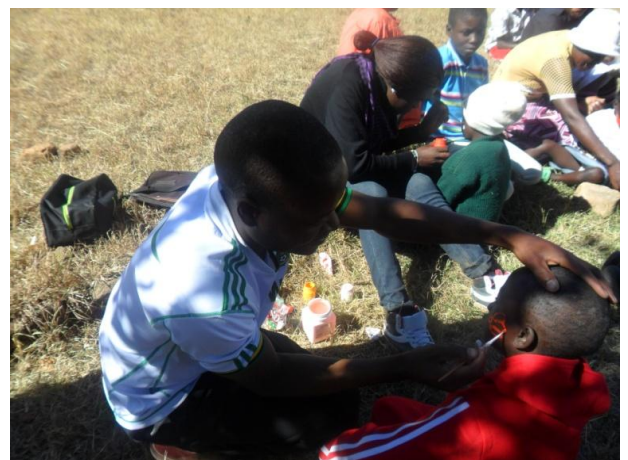
Makepesi support group face paintings