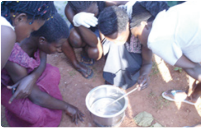
Care givers of orphans and vulnerable children (OVC) during soap making training at the project offices. 30 women benefited from this training session.