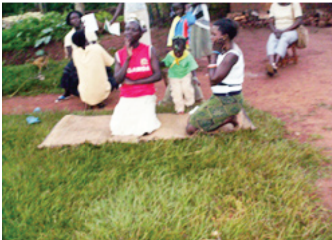
Music dance and drama youth project performing