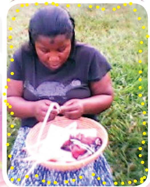
A woman making paper beads jewelry one of the project income generating activities