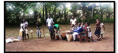
Talent Chain Crew performs for Eden Ministries

On Friday, Eden Ministries had the opportunity to meet with a special group of young people who performed their own creative dance for the staff of Eden Ministries. It was a wonderful experience to see the talent of the youth and their dedicated in their work and effort. They did a great job; and