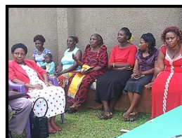
Women in group meeting at Eden Ministries

This has been a tremendous week at Eden Ministries. It was filled with projects, meetings, and outreaches to different individuals in the community.