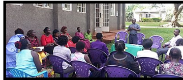
Women's group meeting at Eden Ministries

group meeting on Tuesday in which the women were divided into several groups and elected leaders for each