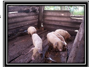
Piglets at Eden Ministries

With that project, if a pig gives birth, then 2 piglets are returned to the project. One piglet is returned to Eden Ministries, the other one goes to a person in need, and the rest remains to that person who has that pig. This creates a way for