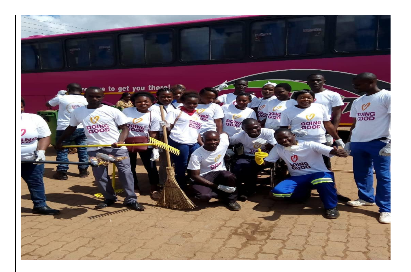
Good Deeds Day volunteers group photo after cleaning in Solwezi District https://www.good-deeds-day.org/