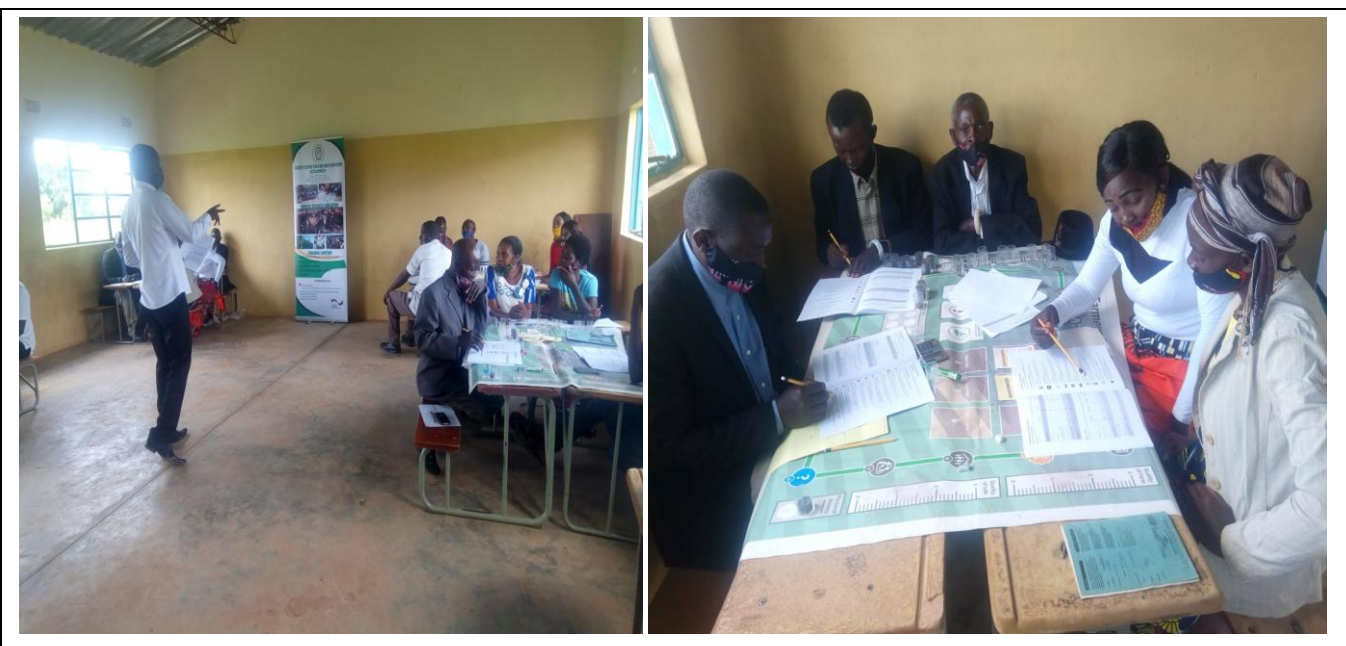
Farmer's Business Simulation Training at Katete primary school - Small scale farmers attending the training