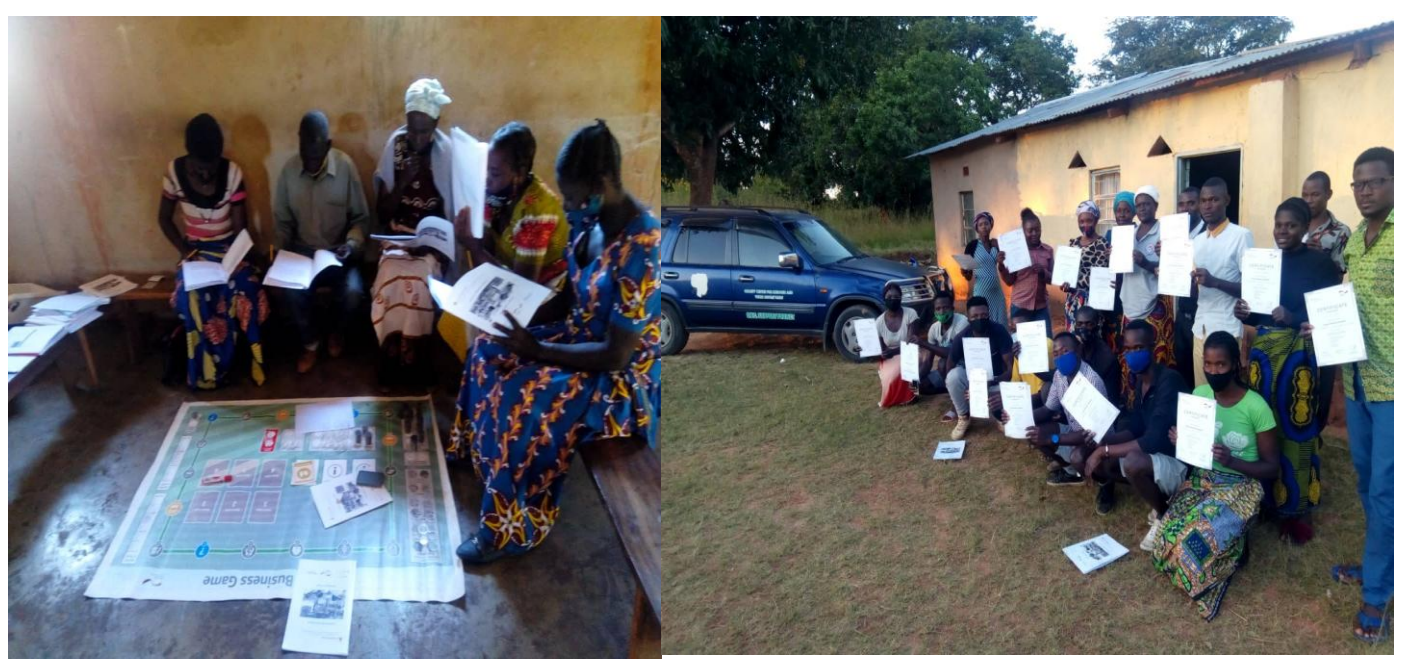
FBS training in Lubofu and Kamusongolwa areas of Kasempa District of Zambia.