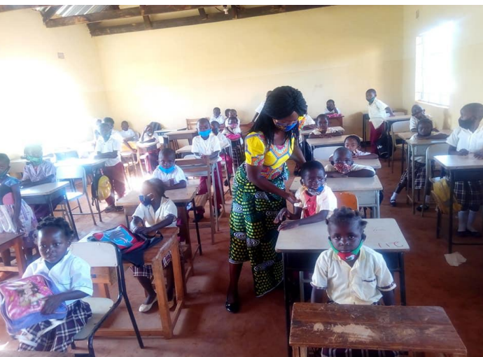
Fortune School of Excellence for orphans and vulnerable children