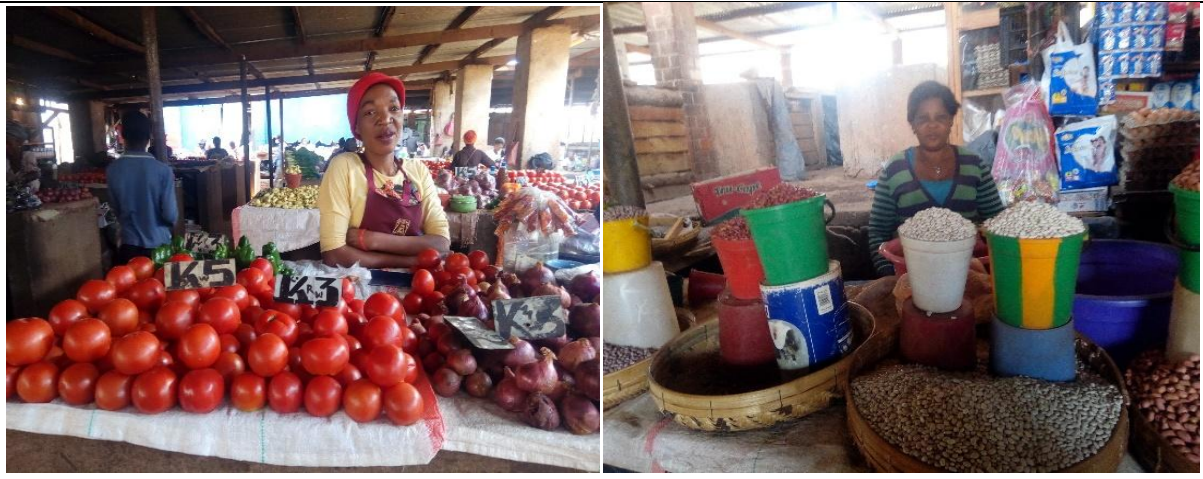
Some of the beneficiaries of COVID'19 Relief fund in Solwezi.