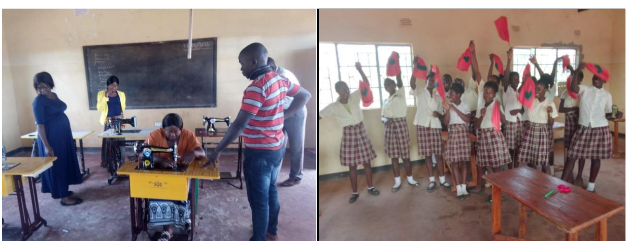
Production of Reusable sanitary pads going on.

The organization in May 2021, Partnered with The Pollination Project (TPP) to implement the Reusable Sanitary Pads Initiative project. The project aims at helping girls to remain school during their menstrual cycle. So far the organization has started the production of reusable pads to de distributed once schools reopen.