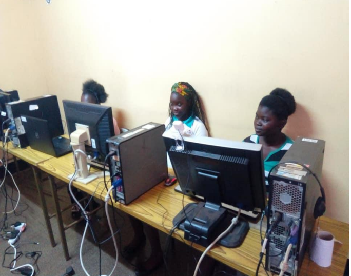
Children attending free virtual learning at Fortune School of Excellence - 2021