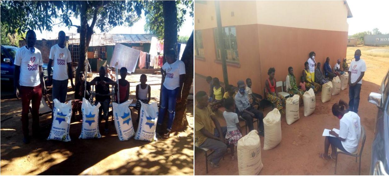
Provision of Relief Food to vulnerable people during the outbreak of COVID'19

Charity Centre for Children and Youth Development, working in partnership with Crutches 4 Africa supported 60 families with relief food which included 40 x 25 kg mealie meal and 20 x50kg white maize.