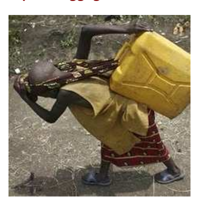
20 kilos each, everyday, sometimes twice

or even this, collecting water in metal containers, balanced on their heads, totally unsuited to hold clean water. They leak, they rust and they are heavy!