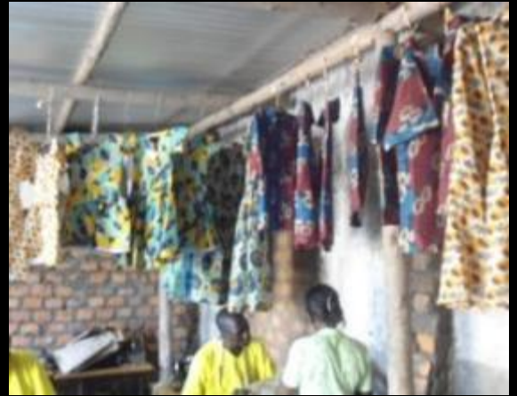
Samples product of the dresses

15 inmates undergone 6 months skills training on tailoring and gament cutting, they were trained with the skills and knowlages in making males , females and children dressese of difference fashions., The skills these inmates gained will help them upon released from prion to start up their own tailoring workshop at their respective village and make money for their income to meet their family basic needs and improve their quality of life and they live a productive life in their community( ROCO KWO ), These trained inmates promised that the skills they gained after when they are released from prion they will create their own job and generate income to earn them and their families a living.