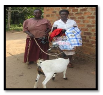
OVC Family received scholastic material And a goat for income generation.