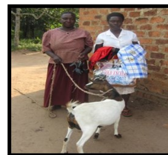
OVC Family received scholastic material And a goat for income generation.