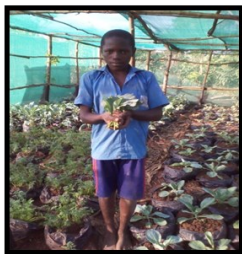
OVC beneficiary harvesting vegetables

It is committed to transforming lives and working towards providing positive changes in lives of orphans, vulnerable children, people living with HIV/AIDS and all marginalized individuals in Uganda.