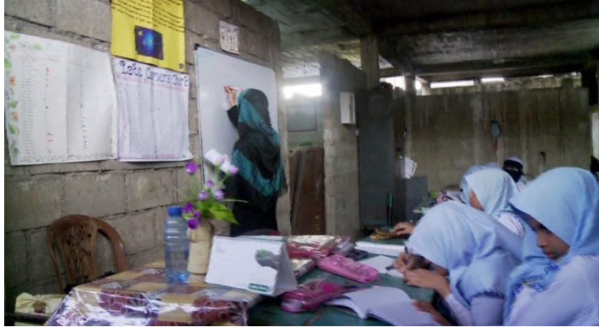
A) A class room of girls senior section

The following images will represent the real status of the school.