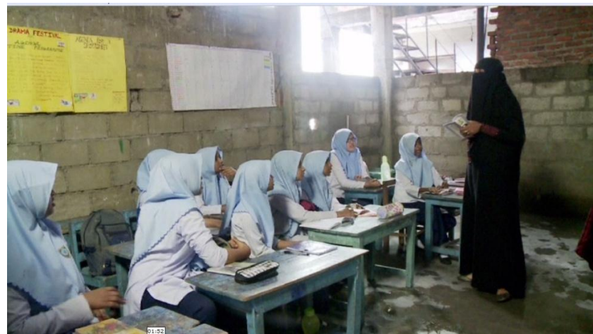
B) Benches used by students (girls senior section)