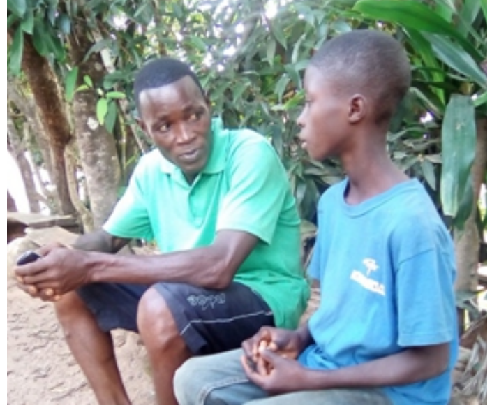
Improving access to quality education especially for vulnerable and excluded groups of children is part of our services

There were many lost generation of young illiterate parents without the yearning for educated children. More so, many females, the majority of the population are uneducated due to the macho tradition that prioritizes boys' education (preparing heirs) over that of girls. To date, literacy rate in the Northeastern region is 10 per cent point behind the national status. Vocational skills are also missing. The few children in schools perform poorly and hardly complete even the basic primary education.