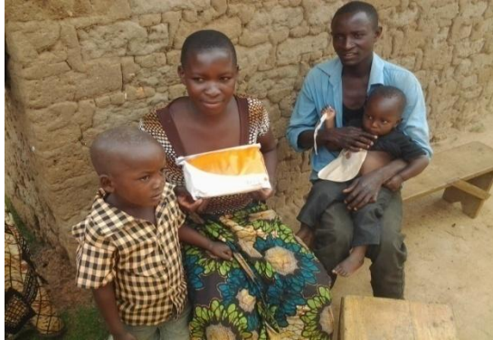
Home visit to a child with colostomy

Throughout Western Kenya, Nyanza Kenya Ostomy Association (NKOA) leads with knowledge and compassion. The growing philanthropic support received from grateful donors, patients, families and community members serves as a powerful validation of the goal of our association to improve quality of life of patients with wound, ostomy, continence and colorectal cancer