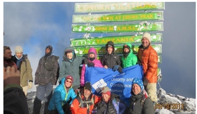
Photo taken at the peak of Mt. Kilimanjaro Tanzania (19 th -Septemeber 2013)

NKOA continues with her personal giving campaign, originally launched in 2013 at Mount Kilimanjaro Tanzania. While a relatively small number of organization has chosen to give an additional charitable donation to the Association, the amount of their donations has been significantly higher than the association standard, and this bodes well for the future of this campaign.