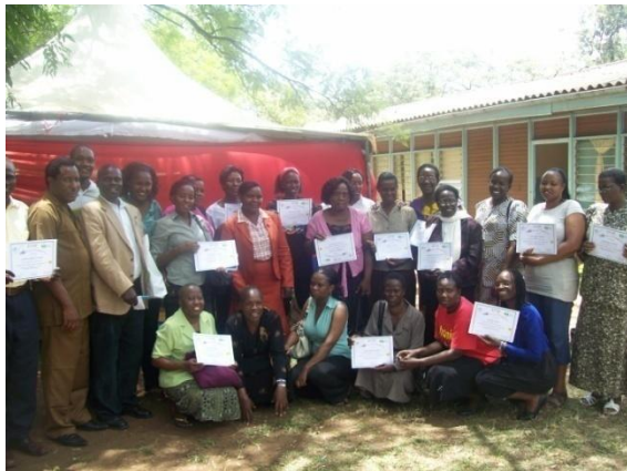
Health care professionals issued certificate upon completion of ostomy surgery and care training