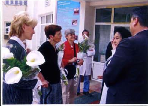
MTI donors meeting the staff of Orphanage for children with special needs