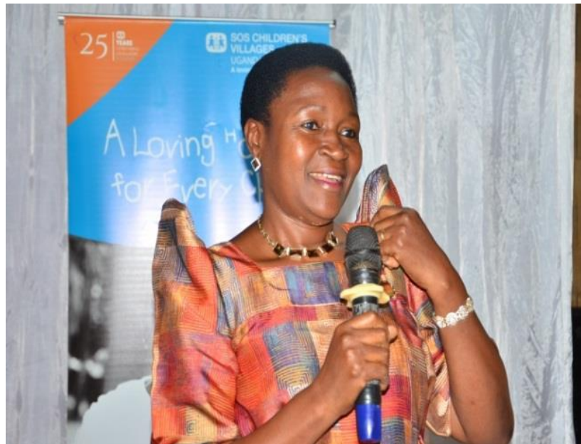
Hon.Minister Rosemary Nansubuga Sennide giving her speech during the Conference

She also urged parents to always be part of such conferences whenever they are organized so that they can hear their children’s voices regarding their Rights and whatever is going on in their lives.