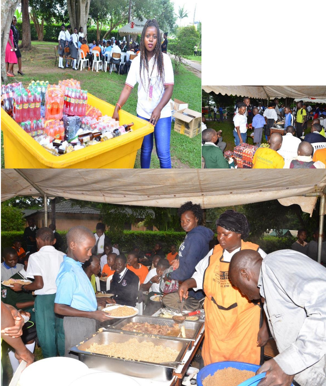
Children receiving food and drinks.