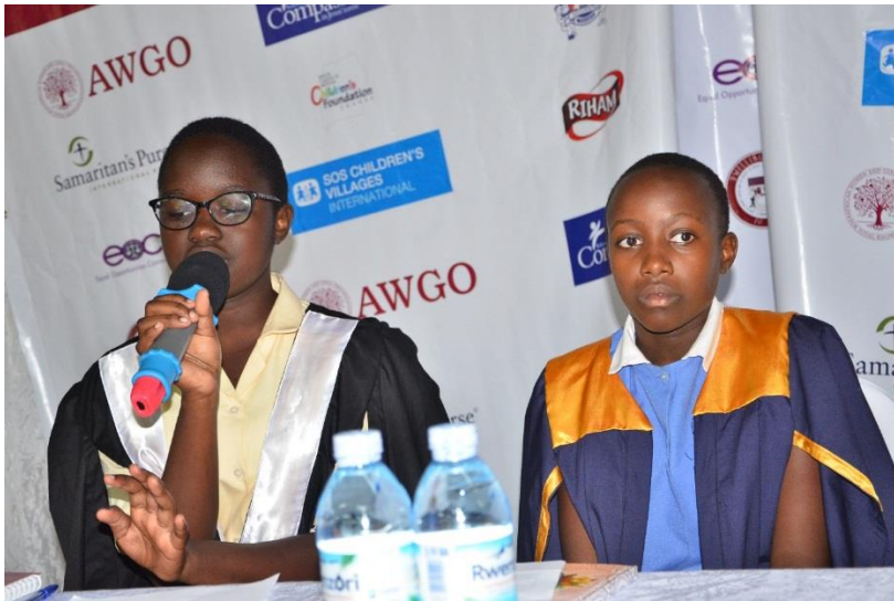
The speaker of parliament and her deputy during the Parliament session

3.2 Press Conference: Ten Children were chosen to participate at the press Conference, they introduced themselves and the schools they had come from. They expressed their views and they wanted to see changes in the following areas;