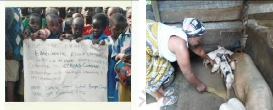
Rise for Nature integrated project activities by CCREAD-Cameroon

The Rise for Nature Program (RINAP) is an integrated environmental sustainability program which CCREAD-Cameroon launched in 2011 to respond to nature conservation and rural development needs in many hard to reach forest communities of Kupe Muanenguba Division of Cameroon. For the first components of the program, activities were targeted towards forest and wildlife conservation unsustainable practices campaigns, environmental education through schools, climate change and adaptation education, instituting alternative livelihoods activities with indigenous forest communities and advocacy for the respect of the rights to benefits from natural resources. Through campaigns and field actions, 25 communities have been reached, 27 schools covered and 2 regional advocacy forums held by the end of 2012.