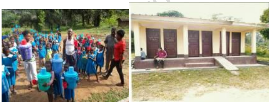
Direct assistance to needy schools in marginalized forest communities

** All these activities are ongoing and require continuation with the support of prospective partners like you reading this brochure. We value your partnership.