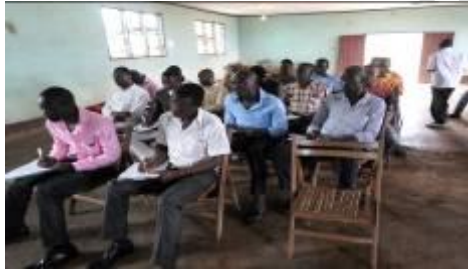
Leadership trainings by CCREAD-Cameroon

6.2 Fighting corruption and promotion of good governance. Recognizing that corruption remains a key development limiting factor in most sectors in Cameroon, CCREAD-Cameroon has also joined other stakeholders in fighting corruption. Starting with schools in 2011,