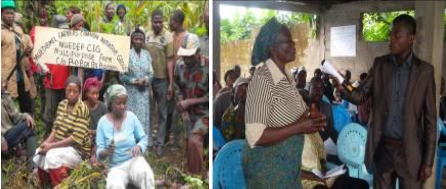
Assisting local community groups on poverty alleviation and peacebuilding

Many inter tribal conflicts results from land problems and the marginalization of particular groups. CCREAD-Cameroon has been responding to these problems as mainstreamed peacebuilding actions by organizing communities into groups, educating them and assisting them to start group initiatives for poverty alleviation/solving land conflicts.