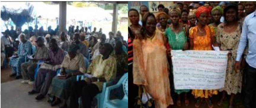
Training groups on PPME, Fundraising and networking for poverty alleviation

Started in 2011, this project targets training of women and youths constituted into development common initiative groups on identifying community problems, documentation, elaboration of micro projects, finding and mobilizing resources, creating relevant partnership monitoring and evaluation/reporting of their result to the general public. CCREAD-Cameroon has organized 12 regional trainings/follow-up workshops reaching 12 groups through 120 group leaders and members in the South West Region of Cameroon