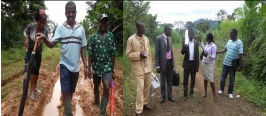
CCREAD-Cameroon staff going and returning from field projects sites