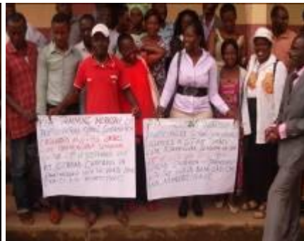
Governance training and fight against corruption campaigns through youth actions