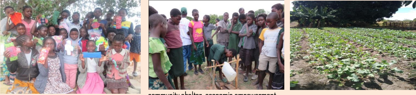
community shelter, economic empowerment,

However, implementation of the strategic plan takes coonizance of assumptions made given the dynamics environment of plan implementation as well as the dynamics of clean safe Water, Sanitation and Hygiene (WASH), Menstrual Hygiene Management (MHM),