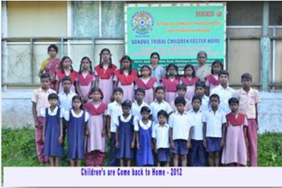
Children's are come back to Home - 2012