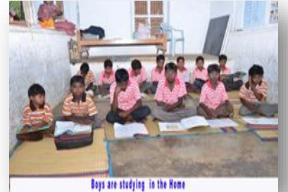
Boys are studying in the Home