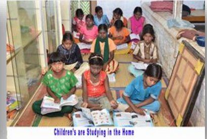
Children's are Studying in the Home