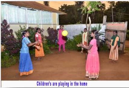
Children's are playing in the home