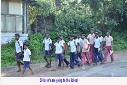
Children's are going to the School