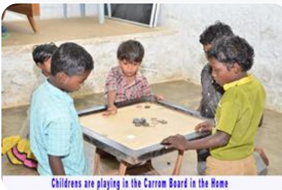
Childrens are playing in the Carrom Board in the Home