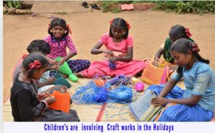
Children's are involving Craft works in the Holidays