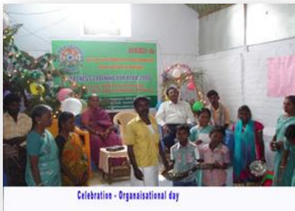
Celebration - Organisational day