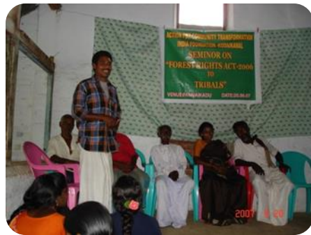
Recognition of Forest Rights Act – 2006 Campaign