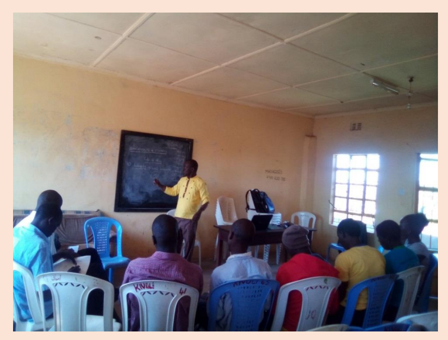
Rakamega County Youth Agripreneurs Association members listening to the facilitator from Excel Supplies CBO during training on Bookkeeping & finance on 12th December 2019.