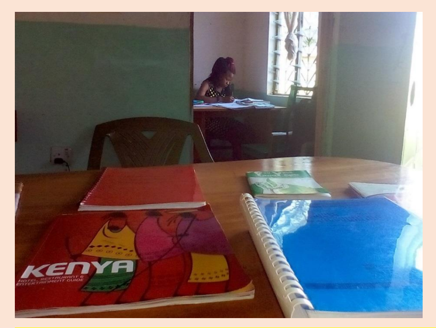
Excel Supplies CBO Youth Friendly Resource Centre office. Appearing in the background is Maximila Makale, student number 12027 of the organization's institute, studying in this photo taken on 29th December 2017.