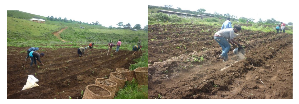
Practical training on manure application and solanium potatoes cultivation