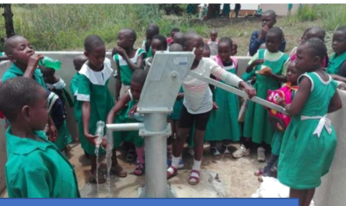
EP Mayel Ibbe Borehole