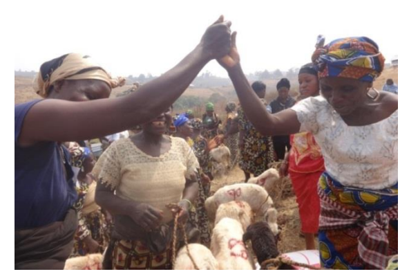
Women groups during and after training workshops