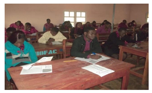
Participants of long course training receiving theoretical lessons

In the course of this year 35 participants received practical and theoretical training at H4BF demonstration farm. The three months course was carried out in collaboration with Ministry of agriculture. This training course was done in alteration (2weeks theoretical training at the centre and 2 weeks with reference farmers). These participants completed their training with a final result score of 96.69%.