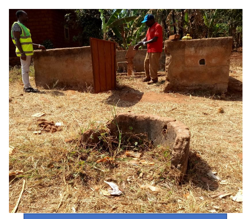
Waste pipe blocked