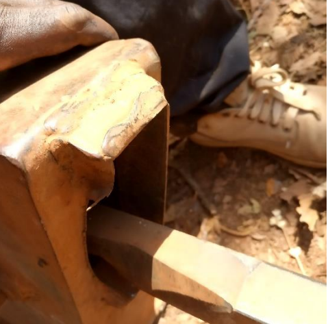
Head of the pump damaged and removed