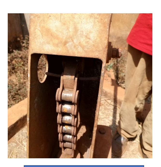
The pumping chain tied with nails instead of screws(boles)