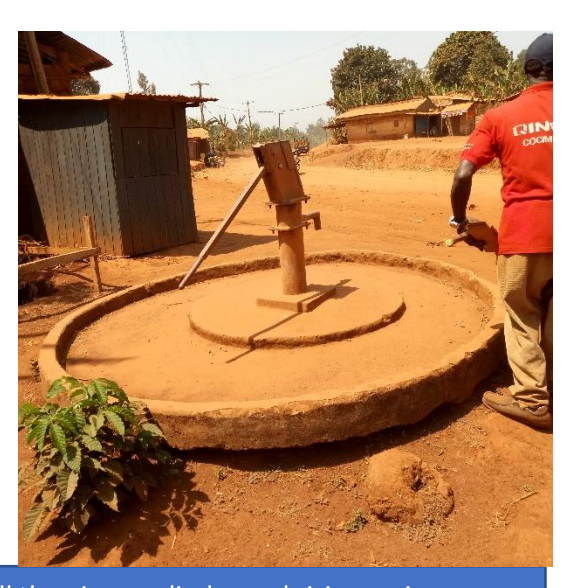
Loosed Pump: from enquiries we were told all the pipes, cylinder and rising main we