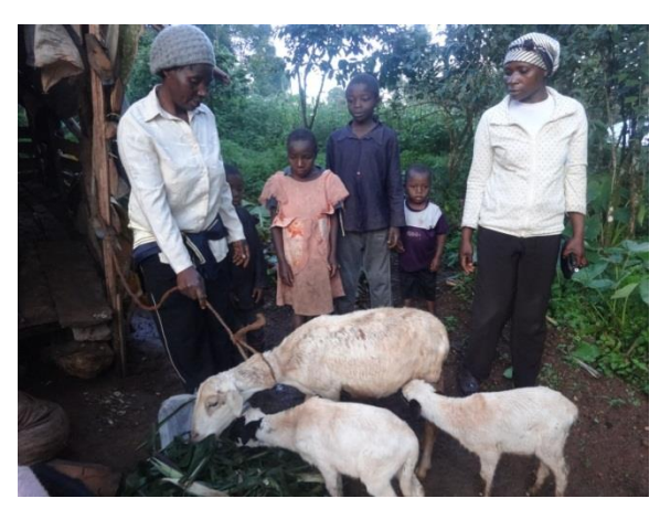
Short course participants with her sheep that has produced 2 lambs