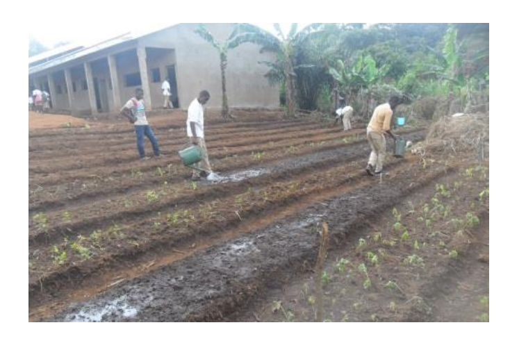
Students of beneficiary schools using equipment/ H4BF staff giving lessons on bed formation