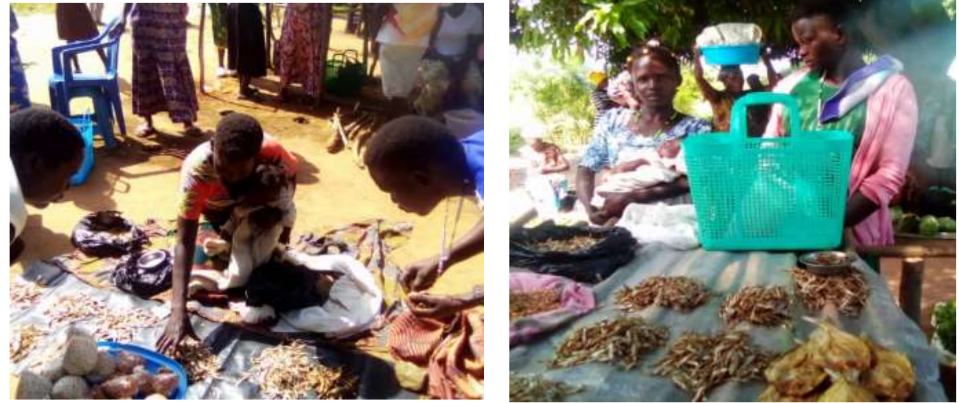
Teenage moms offered cash money after training on business skills to do direct small businesses in Omugo