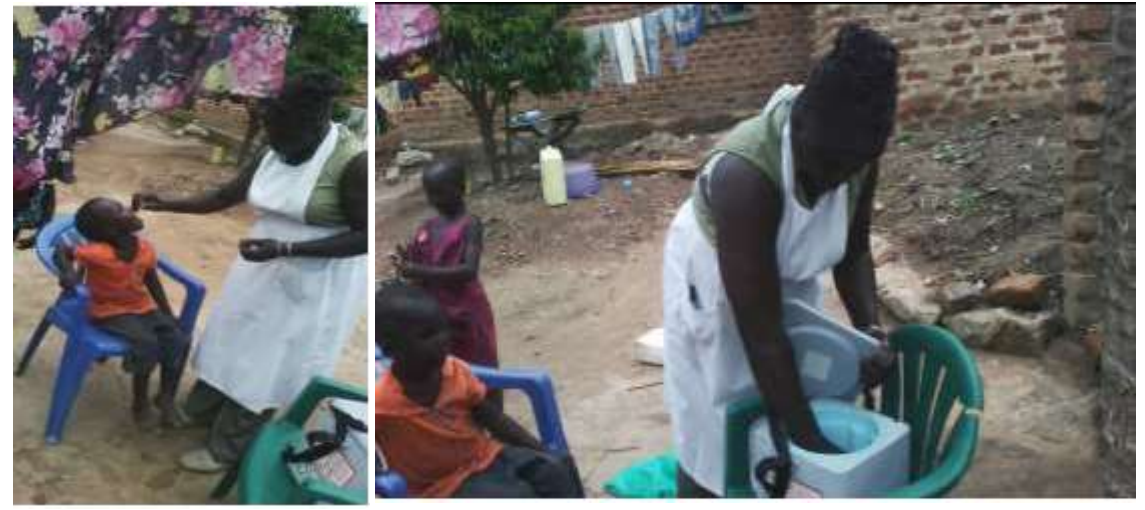
the health of the mother and child's health

More gaps are missing in improving health centres e.g rehabilitation, counselling and guidance and psycho-social support from those with HIV/AIDS, drug addicts and orphans. Many children are getting disables in our routine assessment, many factors contribution to