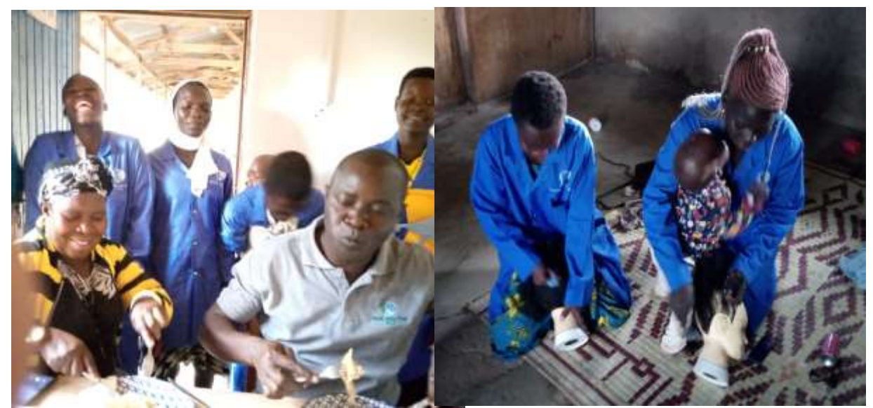
WAF Team tasting food cooked by catering trainees