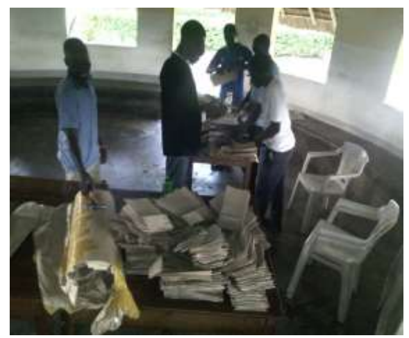
Paper bag making for packaging