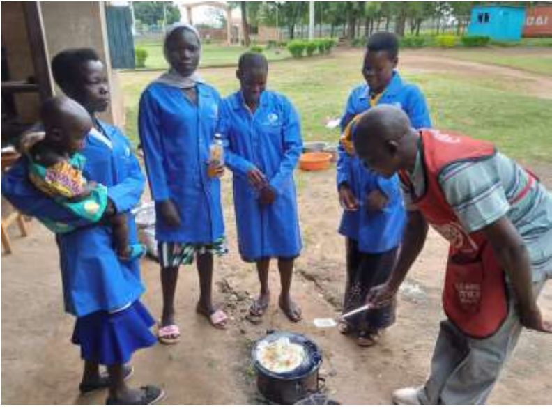
Catering team on training

She was initially arrested taking neighbor's goat to be sold to buy drugs for self and balance to feed her with the child, this didn't go well for her, she was arrested and hand tied by locals, until local councilor from the area rescued her. In the end we provided her with a goat, which will eventually produce and she can sell some off.