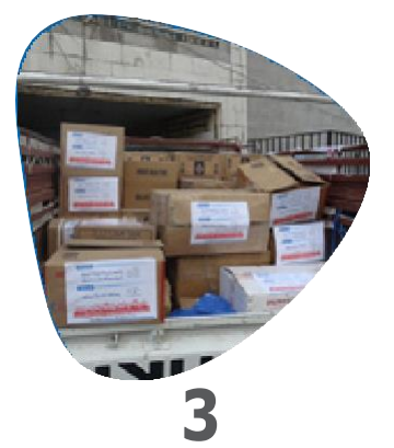
Supporting Health Facilities with Medical supplies.

Provide primary, secondary health care and referral services through implementation of Minimum Health Service Package, provide operational cost and support to ensure functionality of selected health facilities in priority areas in Yemen.