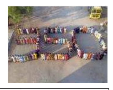
Photo: Robin Bernard Eco Activist & wildlife Expert Addressing Several Eco

campaigns, Solutes, educates, trains & implements the concerned participants to individually & collectively, successfully participate & involve in every level of decision making & grass root level work promoting the ecologically security & sustainable development work.