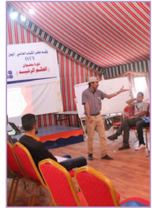
Empowerment and Leadership

Enhancing trust-based relationships between youth and institutions and coordinating with institutions in achieving leadership for youth in all fields, building their capacities, supporting, encouraging and honoring their ideas and products, which enhances the process of creativity and innovation and the beginning of advanced stages of life.