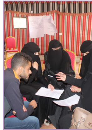
Entrepreneurship, creativity and innovation

Recruiting the resources and increasing the effectiveness of the available possibilities and highlighting the role of partners in the development of youth in various forms and increase the spaces allocated to youth, which leads to increased capacity to give, which contributes to create a readiness for youth to compete in a positive way.