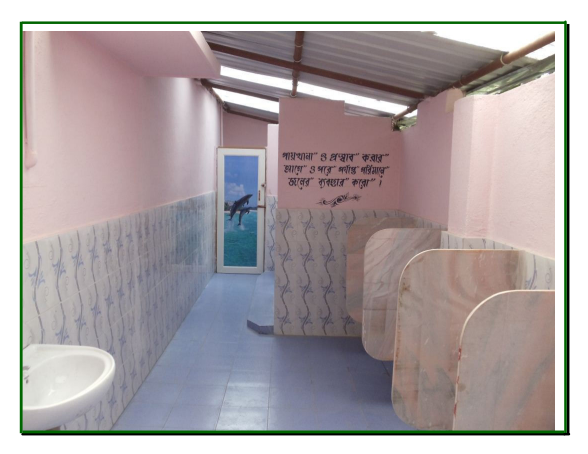
A High School Boys' Toilet