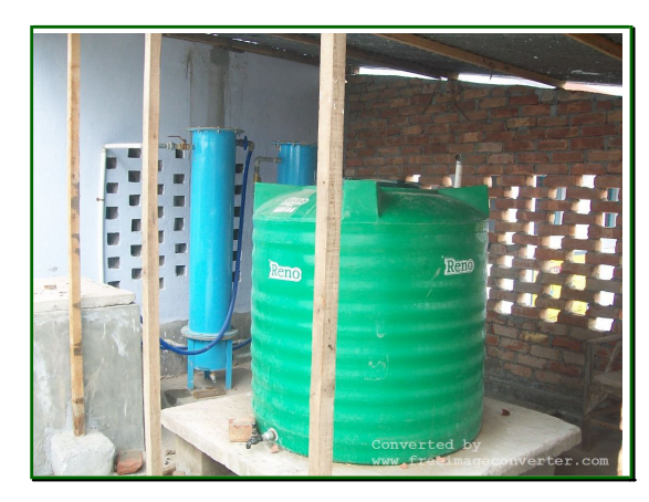
Iron & Arsenic Filters at a high school

Within 1 Year Boys' Open Field Urination Habit Decreased from ≈ 39% to ≈ 1%!!