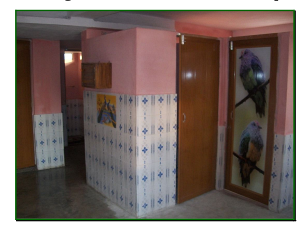
Girls' Change Rooms

@ We have helped in setting up "Change Rooms" in schools for teen-age girls where they can get napkins and dispose off used ones. We have also helped in installing incinerators for the used up nappies.