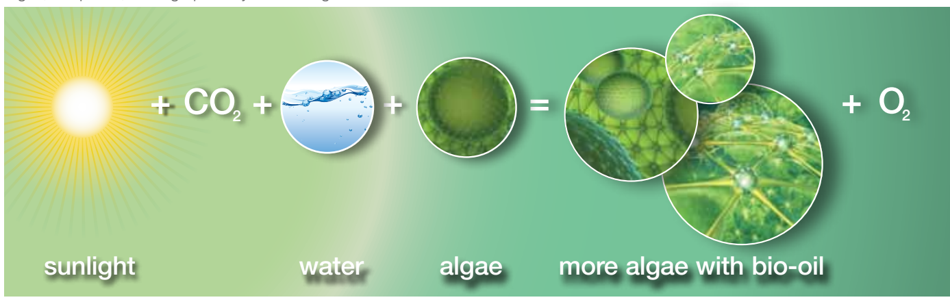
Algae, like plants, undergo photosynthesis to grow.

Algae are grown in either open or closed photobioreactors.