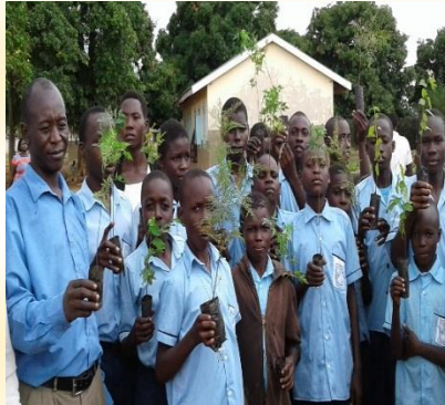
Fig. 3. Above; LCV and RDC of Kumi launching Greening Teso Tree Planting and, below; Young people rising up against climate change