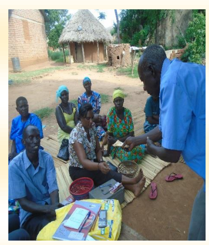
Promoting VSLAs is among our strategies to end financial illiteracy, poverty, and hunger among households.