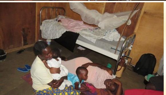
Fig. 1 Mothers taking shelter on the floor as an infant rests on the bed. We seek to advocate for allocation of more resources to the Health sector.