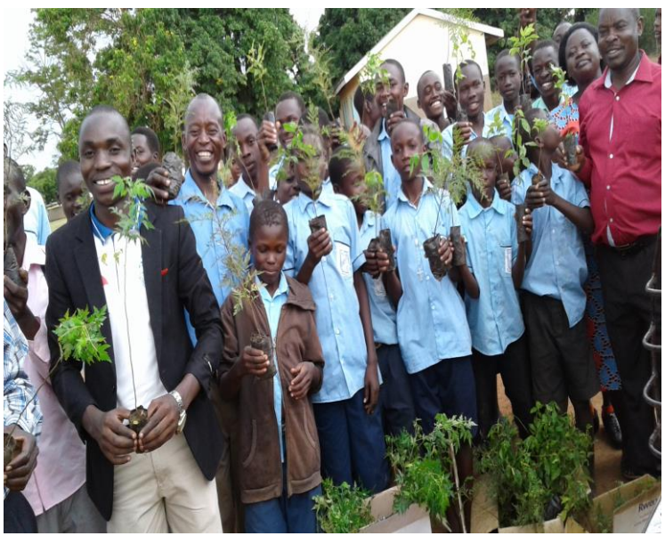
EQUAL-WORLD DEVELOPMENT (EQWODET) Our Strategy 2020 – 2030 Agenda