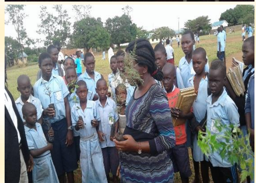
Above; young people participating in a radio talk show and discussing their concerns. Below; young environment champions with their trees.