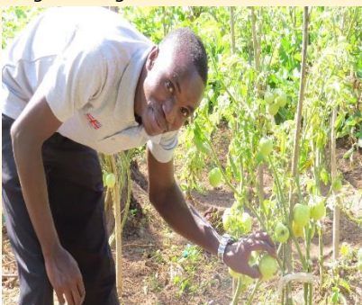
Fig. 4. A member of EQWODET interacting with farmers in a farm