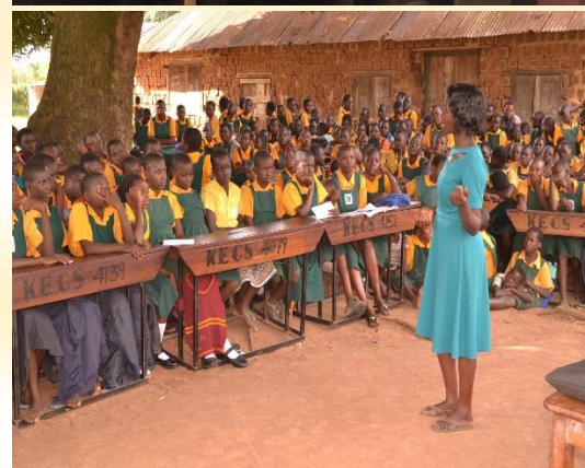
Fig. 2. Promoting learning and education is key in our priority.