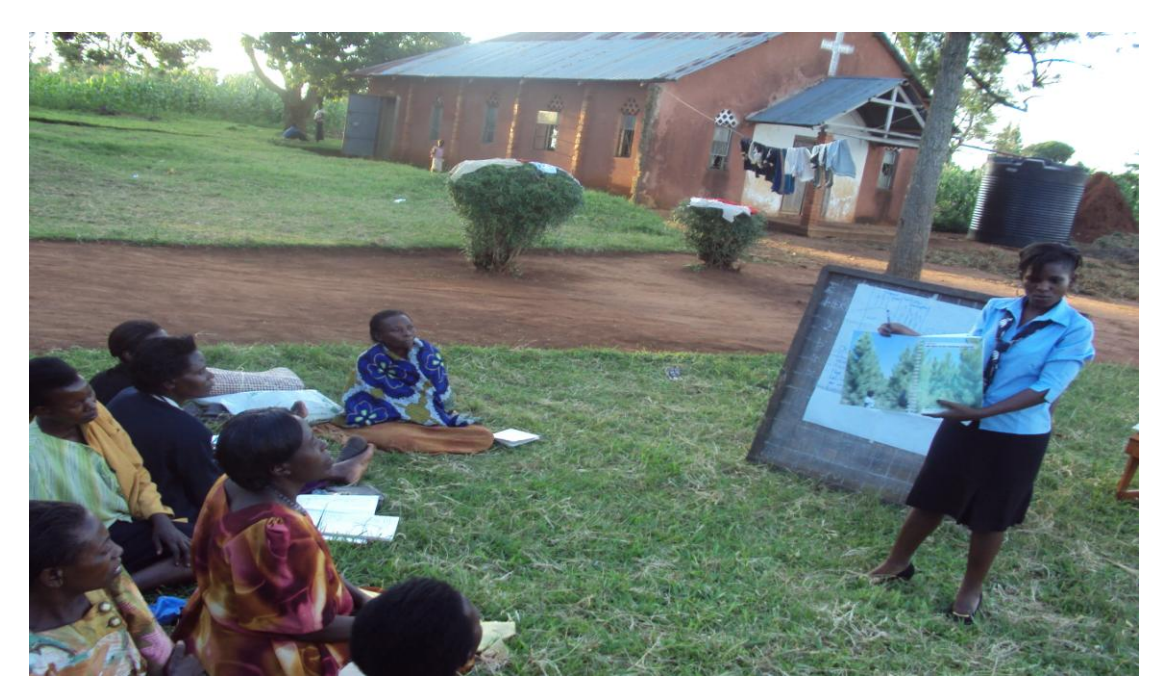
Giving Children Hope Initiative staff expounding on tree planting processes to the community members of Nabato in Mityana.

the project that will lay ground for its final implementation. This has been carried out to ensure popularity and appreciation of the project among communities, so as to boost their participation in environmental conservation.