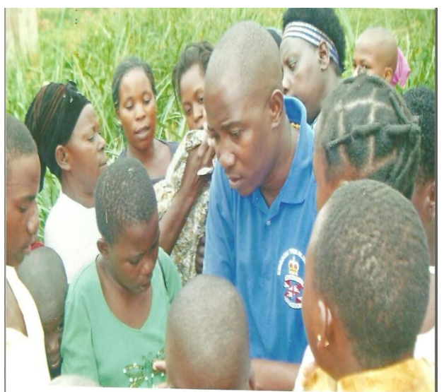
Annual Report 2011

Prepared by Giving Children Hope Initiative (GCHI)