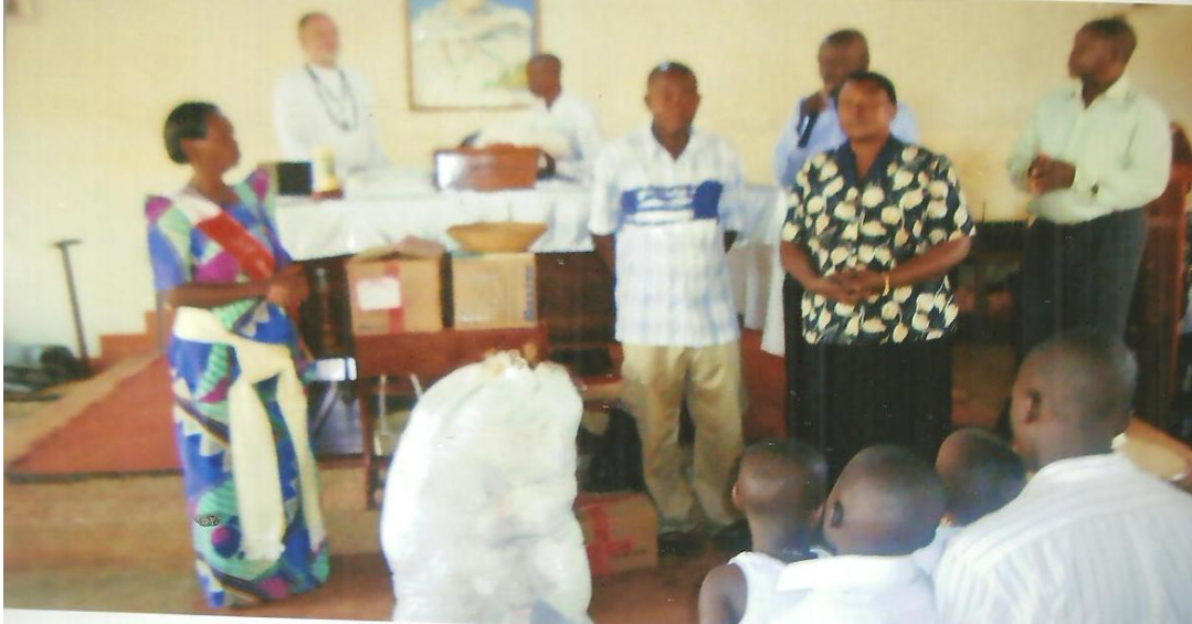
GCHI Members during a handover of different packages to children group in Malangala Parish

Initiative's references. These activities were conducted in Malangala Sub County in Mityana with the support from the sub county leadership.