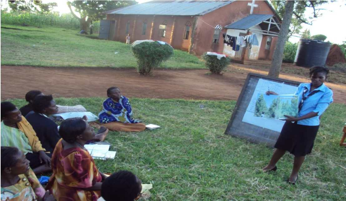
Giving Children Hope Initiative staff expounding on tree planting processes to the community members of Nabato in Mityana.

the project that will lay ground for its final implementation. This has been carried out to ensure popularity and appreciation of the project among communities, so as to boost their participation in environmental conservation.